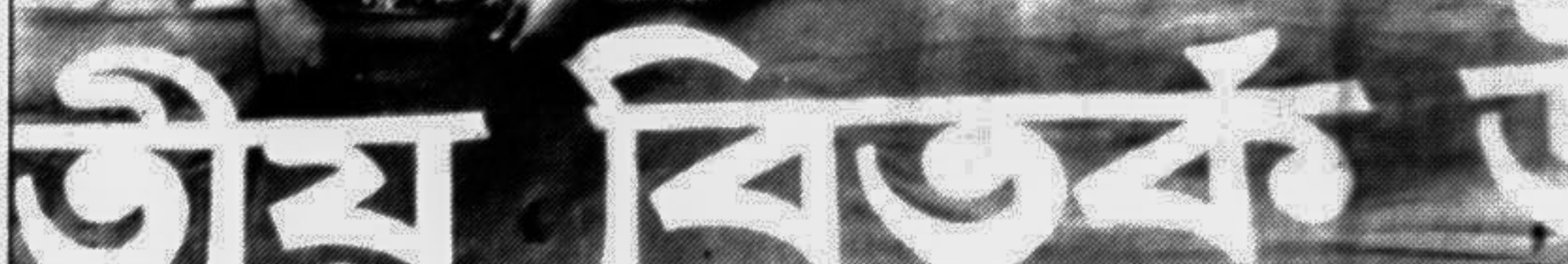
National Debate Federation brought out a colourful procession in city yesterday on the eve of the 2nd National Debate Festival. The three day festival begins in the city today.

Relatives and friends of the deceased have been requested to attend the kulkhwani.