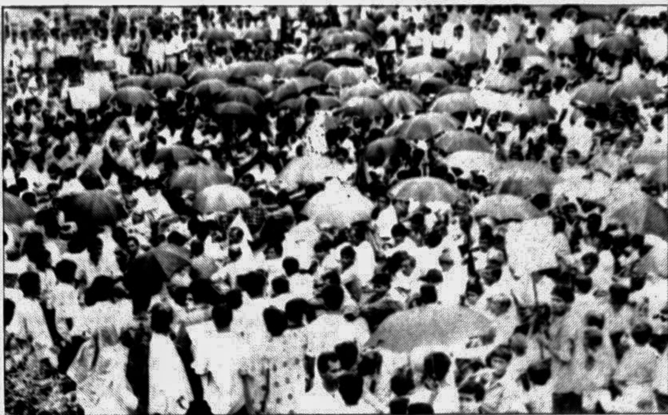
Inhabitants of Rupganj thana of Narayanganj district held a protest rally in front of the Jatiya Press Club in the city yesterday demanding an immediate halt to acquisition of land by RAJUK for building a proposed model town.