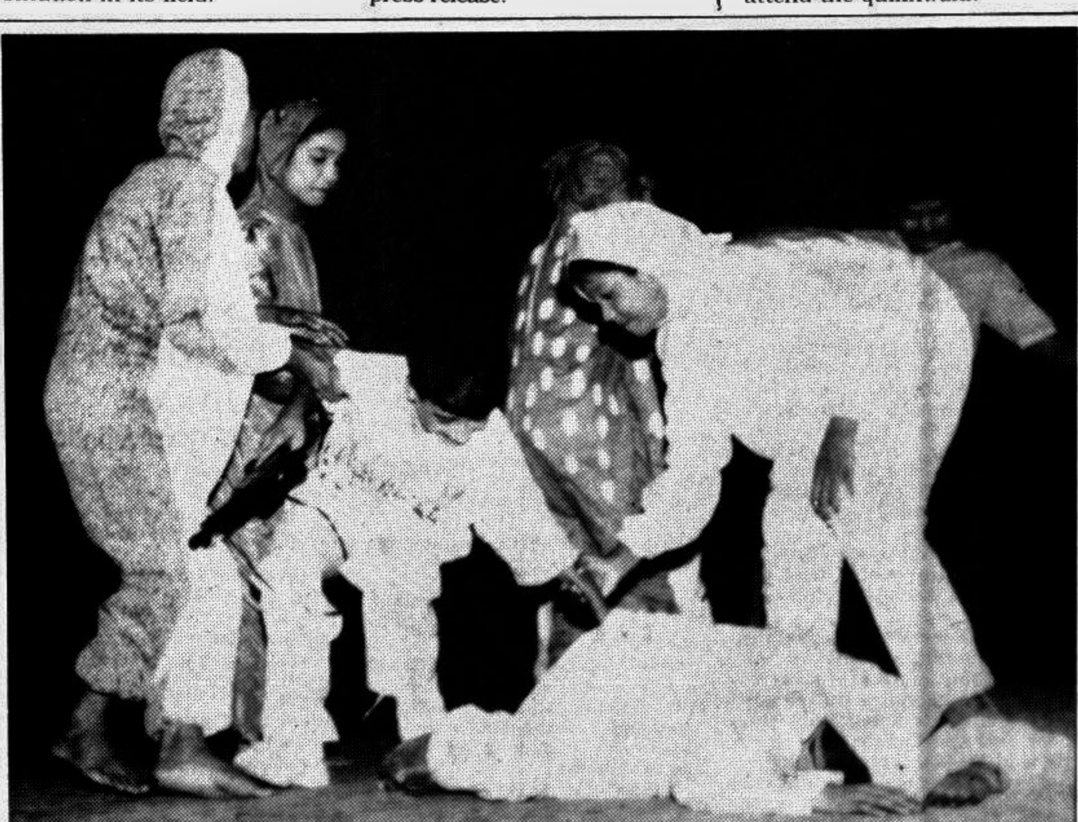
A scene from the play 'Our Environment' presented by students of Shurobhi School under the aegis of the Bangladesh Environmental Lawyers Association (BELA), at the Russian Cultural Centre in the city yesterday.

Sajana An Exclusive Restaurant Serving full range of Indian dishes. Also available * Outside catering * Take away * Party facilities. House-10, South Avenue, Gulshan Phone: 603507, 871884, Fax: 8802-888902