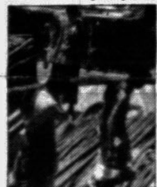
Planning for Dhaka's Future Page 3