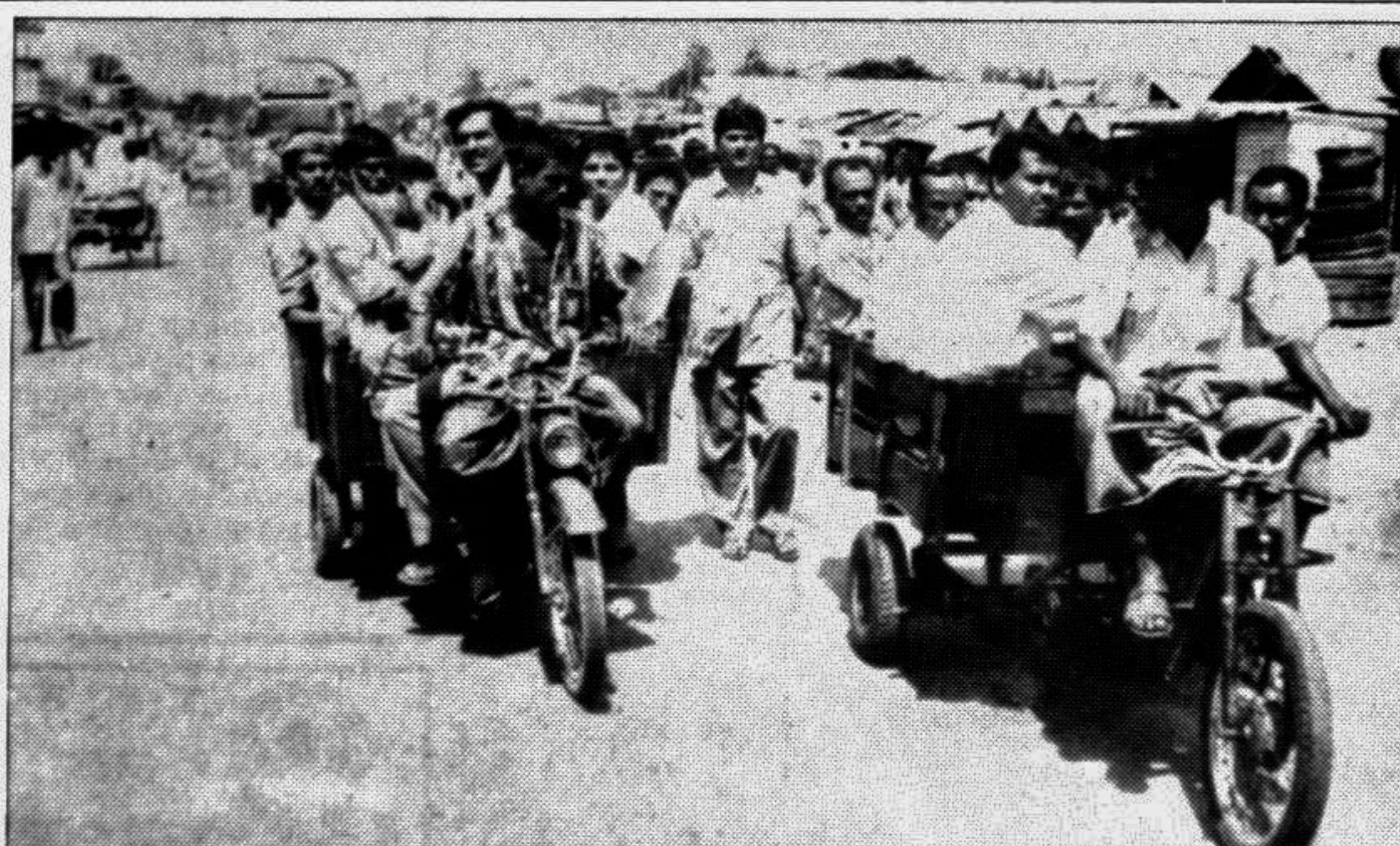
'Helicopters', as they are called locally, are doing brisk business now in Bogra where a bus-minibus strike began on Tuesday. The three-wheelers, made with shallow tubewell machines, are popular in the district.