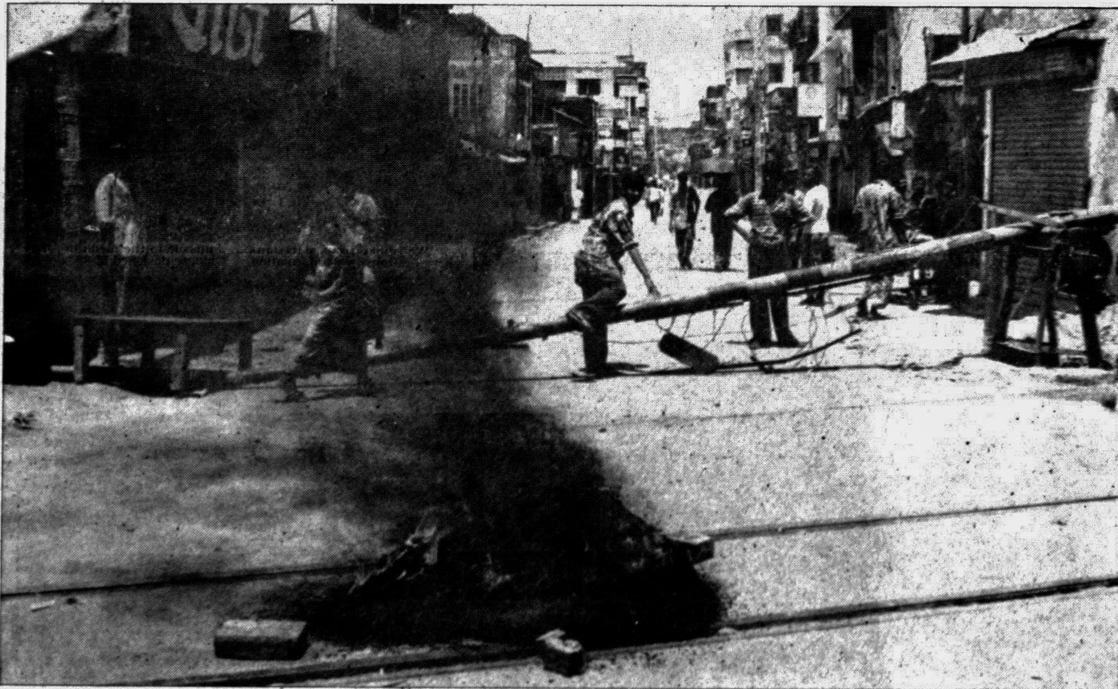
People protesting the killing incident of a student. Angry mob set on fire a tyre on the rail way line near the Rail crossing gate in the town.