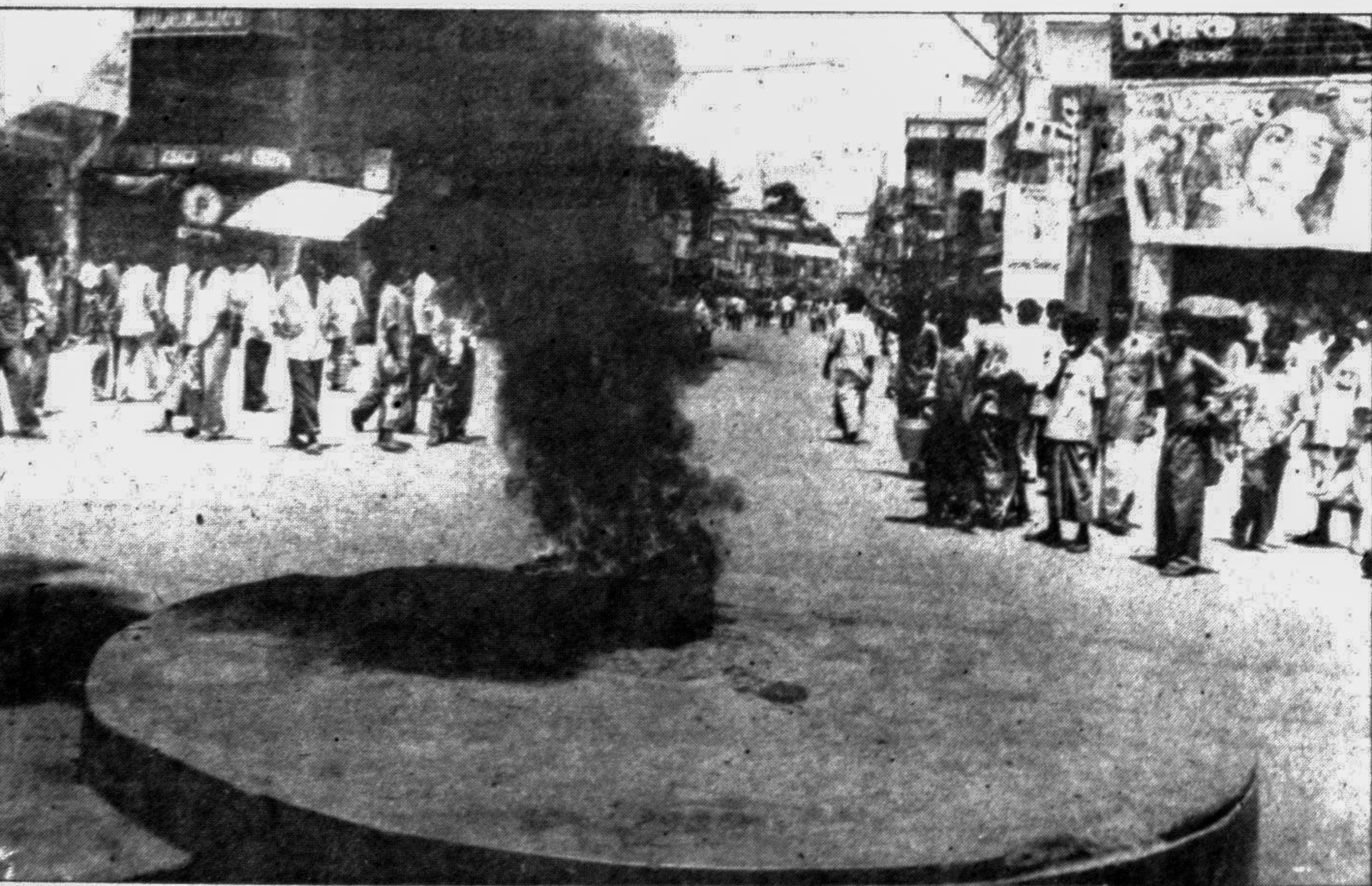
Agitated people set on fire a tyre in Nazrul Islam Road of the town protesting the killing incident.