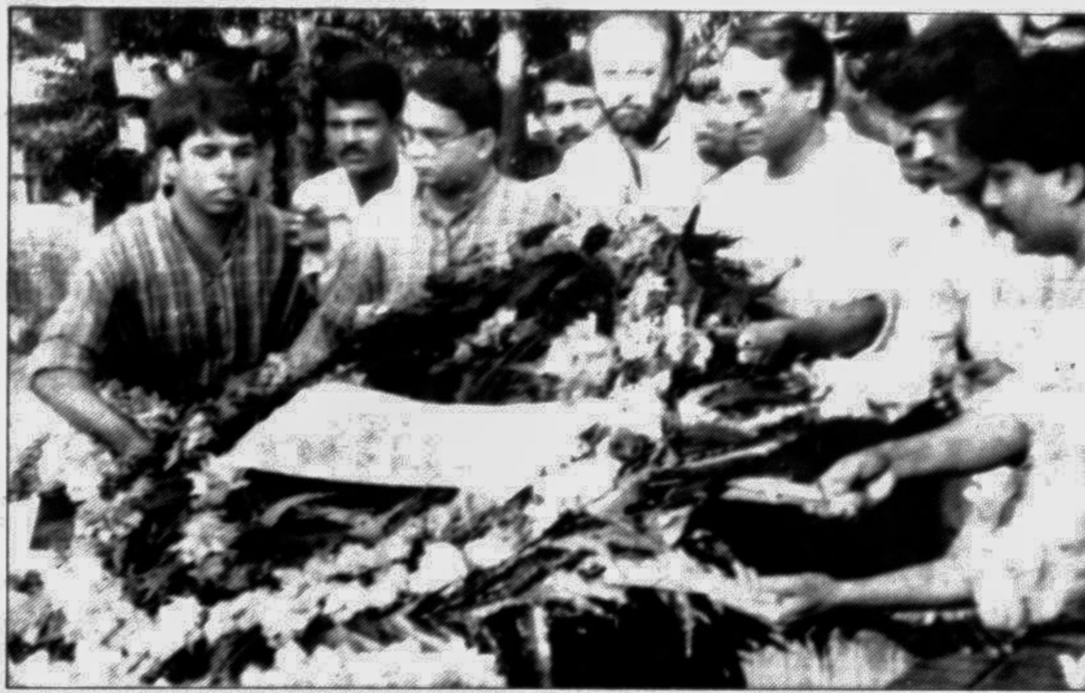
Members of the Nazrul Academy placing a wreath on the grave of National Poet Kazi Nazrul Islam in the city yesterday on the occasion of the poet's 20th death anniversary.

The famous case, framed by the Ayub Khan regime, paved