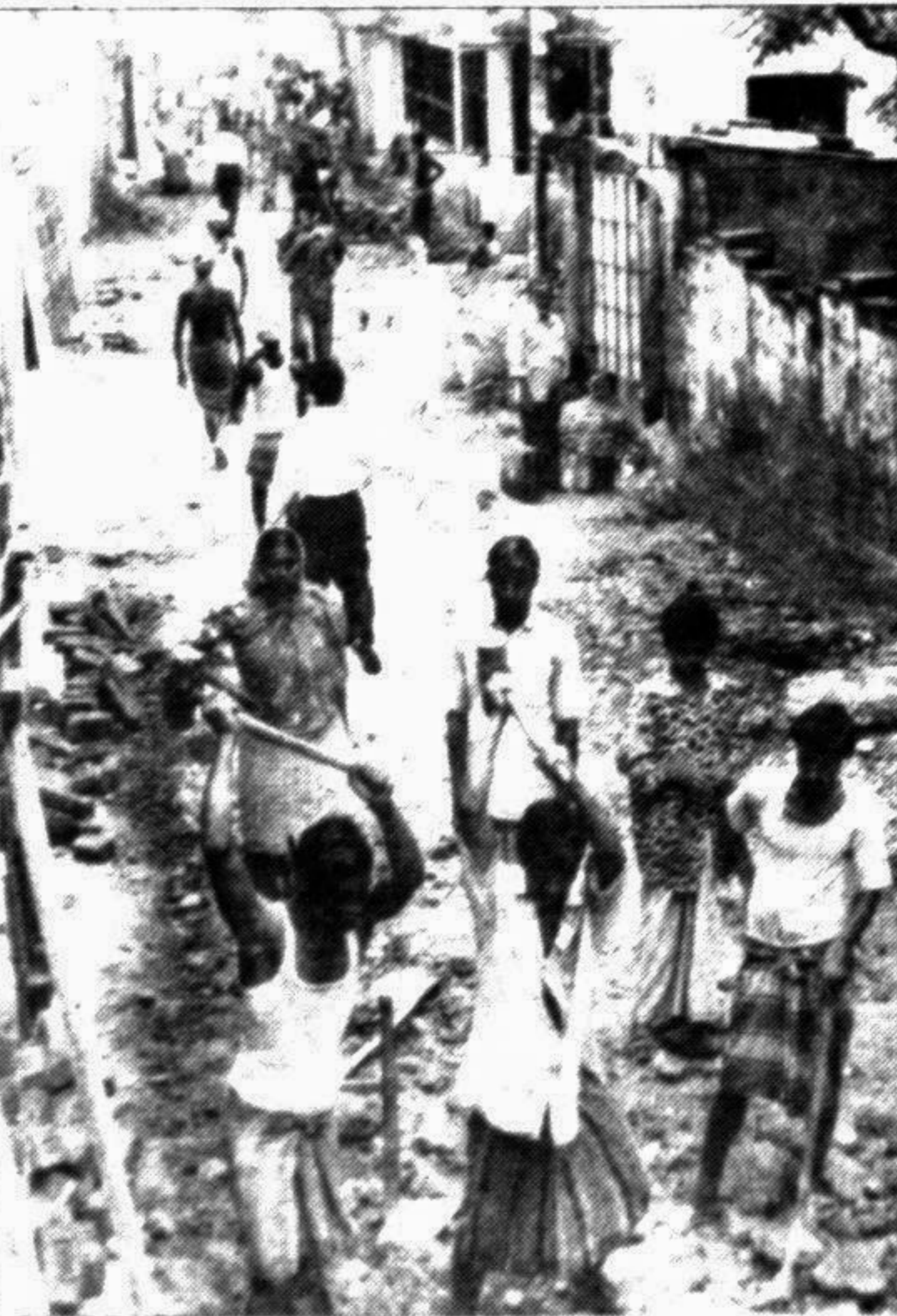
Road works being carried out at a by-lane in the city's Naya Paltan area.

Its group-based organisation can be applicable where an imperfect credit market prevents adequate screening, monitoring and enforcement," remarked the study.