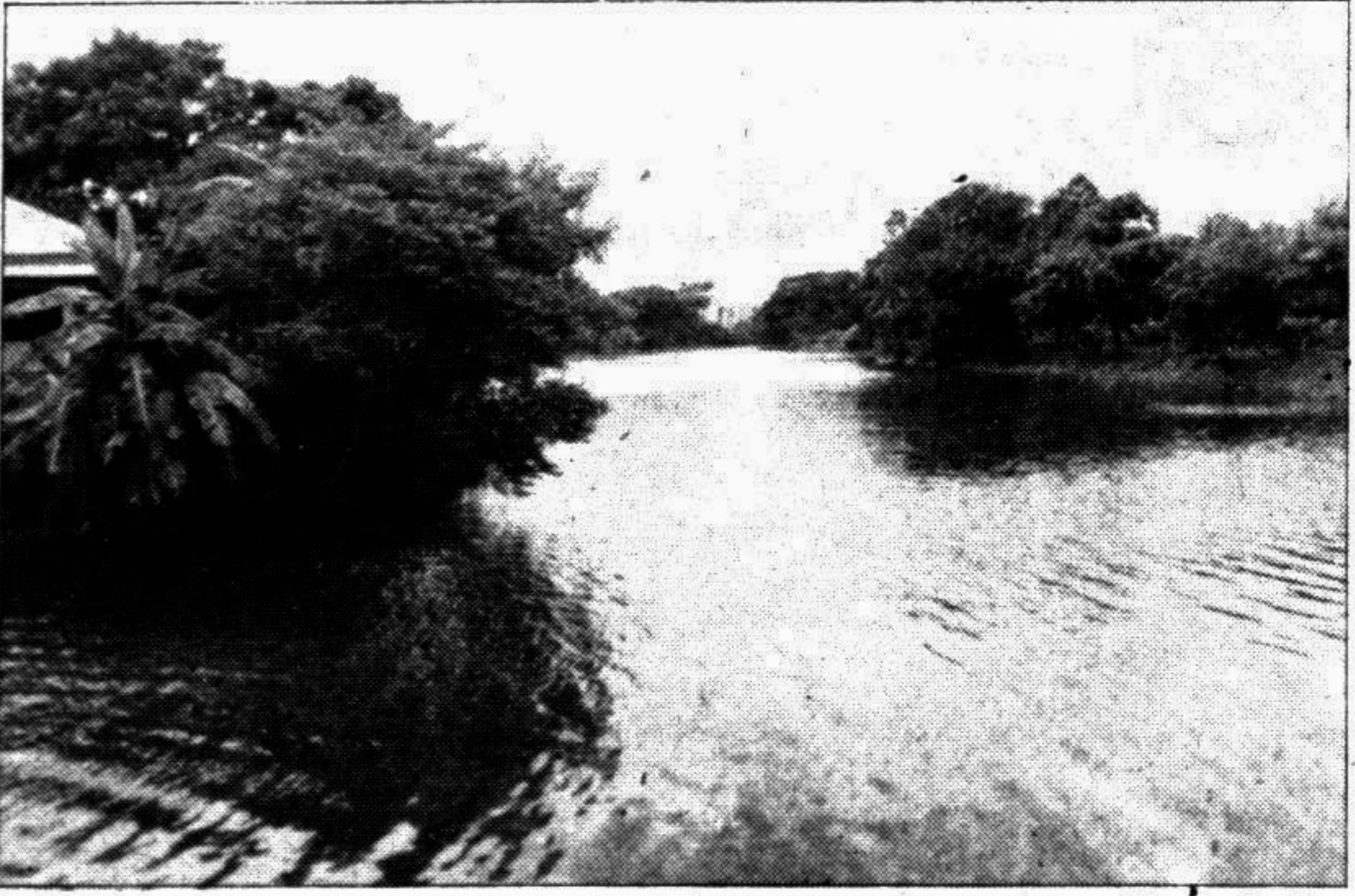
This apparently beautiful look is deceptive.

So the lake remains — not as a grand site to visit once in a while but just as a geographical landmark — as a once unique feature of Dhanmondi — now neglected and forgotten.