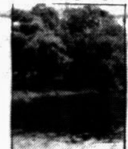
How not to Care about a Lake Page 3