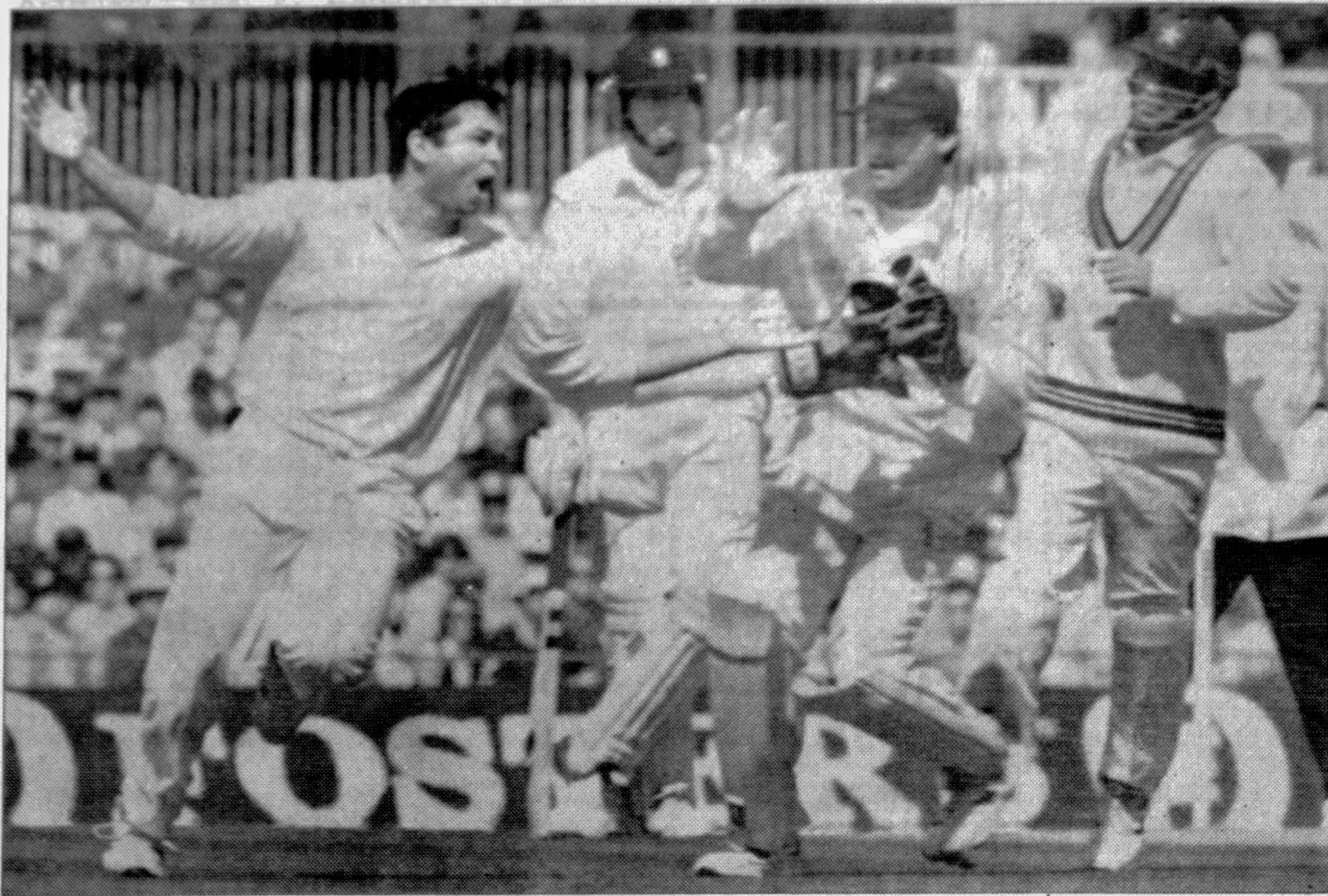
Pakistani leggie Mushtaq Ahmed (L) rejoices after capturing Alec Stewart's wicket on Day 1 of The Oval Test against England on Aug 22.