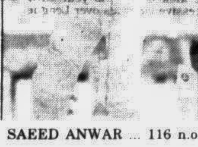
SAEED ANWAR ... 116 n.o

The old ball belatedly began to swing for the faster bowlers and Wasim, who took nine for 103 in the match when Pakistan clinched a 2-1 series victory on their last visit to The Oval in 1992, surged back to remove Chris Lewis for five.