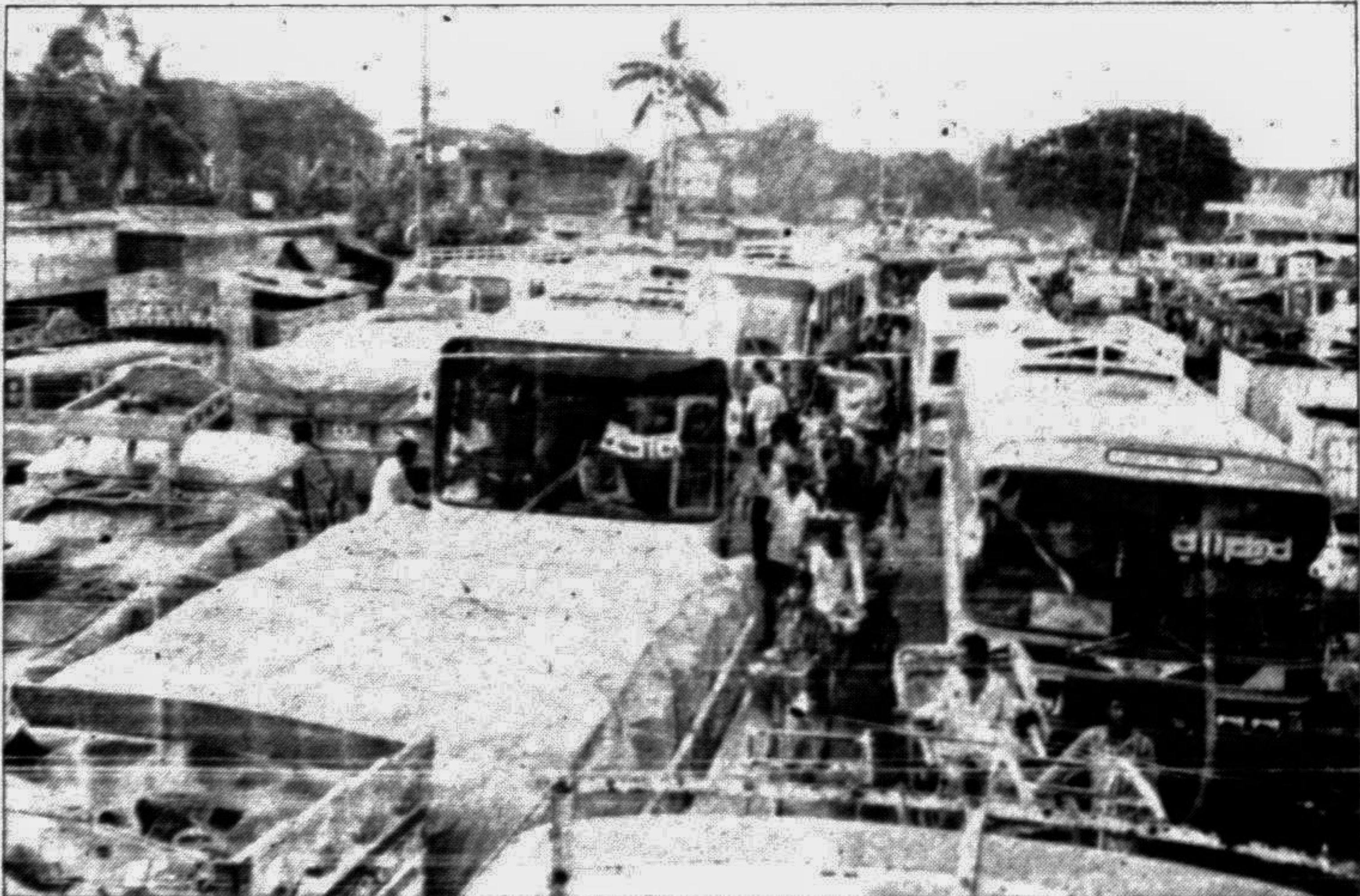
COMMON SCENE: Traffic jam at the heart of the Jhenidah town. Vehicles remain stranded in the busy town streets for many hours often caused by the inter-district buses passing through the town. There is no terminal for the inter-district buses which regularly make stoppage on the main road side near the Chuadanga bus stoppage in Jhenidah town.