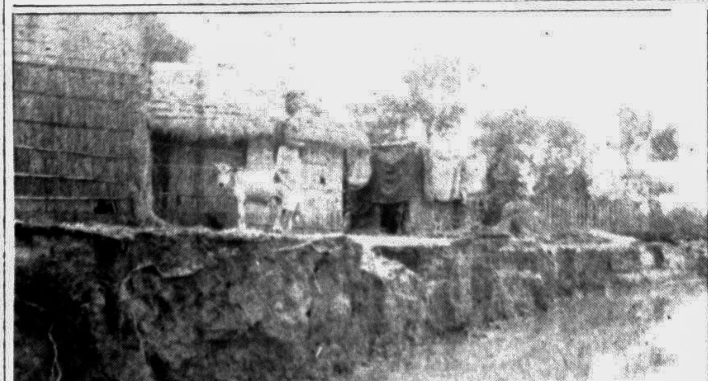
SHERPUR: Erosion of Dosham river still continues. The picture was recently taken from Poyestin char village under sadar thana.