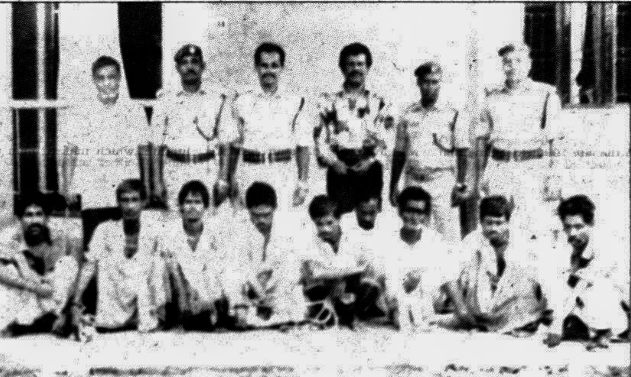
PABNA: Nine persons were recently arrested in a sudden raid who were accused of possessing heroin.

Erosion of the river continued unabated devouring 23 thousand acres of crop land in 22 villages of Harirampur, Shibhalaya and Daulatpur thanas. Nesarganj union of Harirampur has been totally washed away.