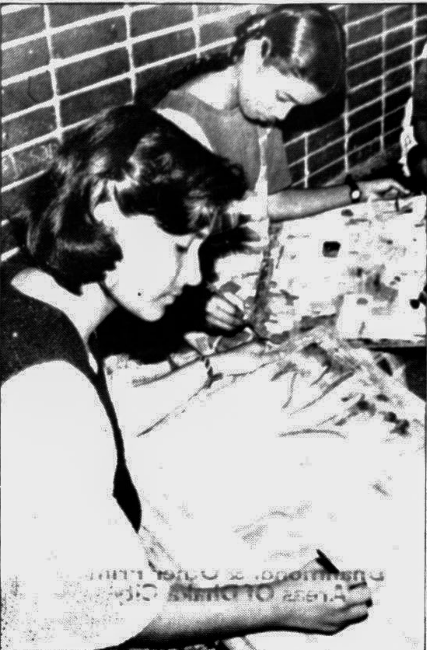
Bangladesh Shishu Academy Federation organised a children's painting competition at the Shishu Academy in the city yesterday.

11. Bangladesh Gas Fields Co. Ltd. reserves the right to accept or reject any or all bids at any stages without assigning any reason whatsoever. PRS-9/031 (TNG)/96 D-897