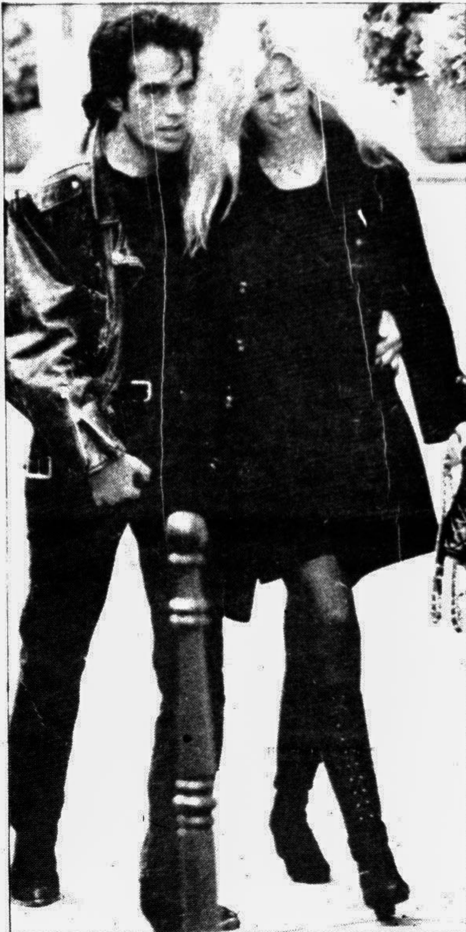
David Copperfield with juicier super model Claudia Schiffer

THROUGH his conjuring art David Copperfield has made the Statue of Liberty disappear, walked through the Great Wall of China, flown on stage and made snow fall, but what most people in this continent know him by is his recent engagement to Super model Claudia Schiffer. Although last year he was tenth in the Forbes' list of top-earning performers, ahead of Arnold Schwarzenegger, Michael Jackson and Madonna — and regularly sells out shows worldwide year after year, the illusionist's wedding announcement has raised his public profile considerably. "I have been on TV for 15 years," says Copperfield, 38. "I get engaged and then all of a sudden, all this attention. I think people care about more the personal lives of entertainers sometimes than the work, even though they pay money and tune in to see the work. It's bewildering." But I guess people don't have much of a choice since they only feast on what the paparazzi dish out in tabloids.