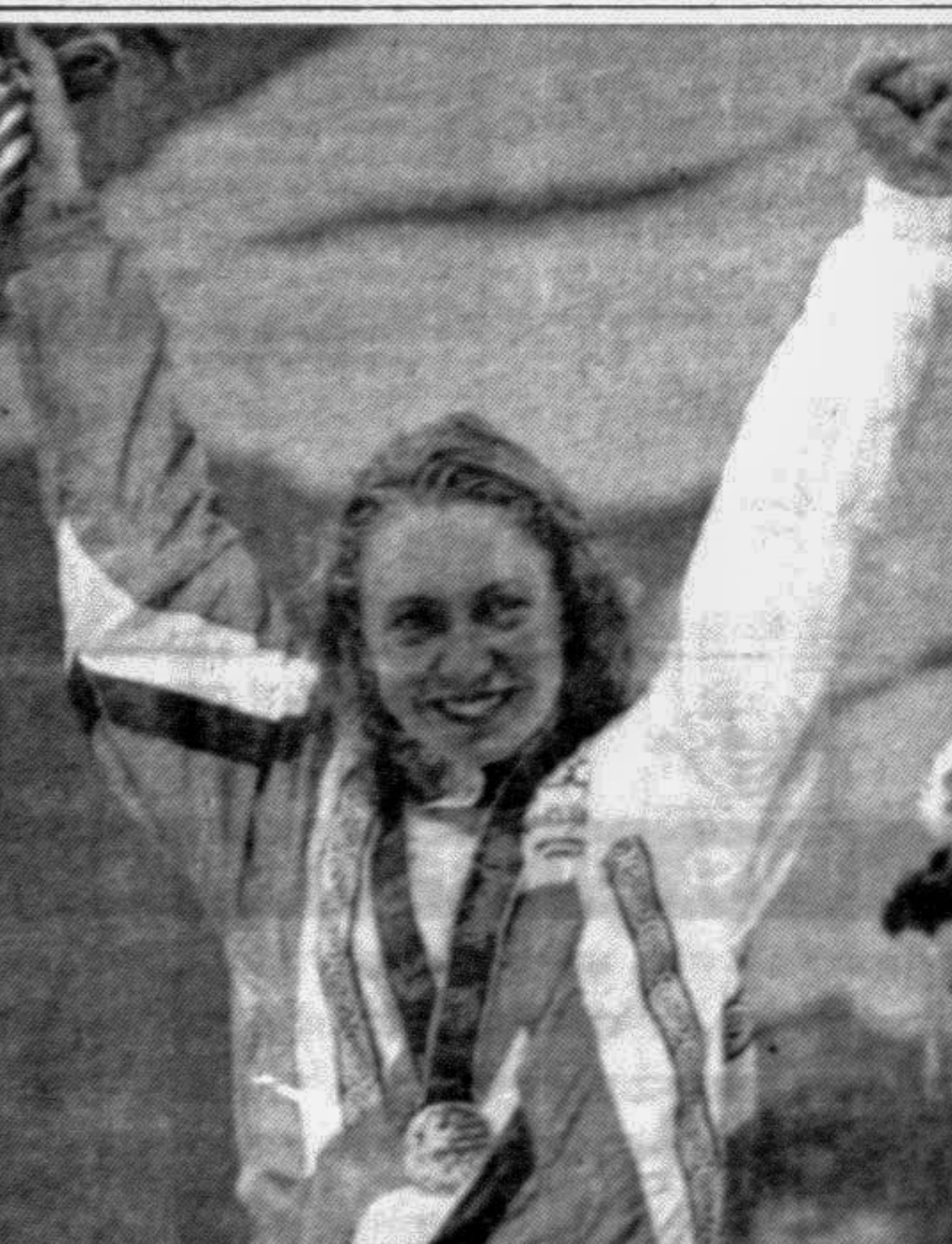
An AFP file photo shows Irish triple Olympic gold medalist Michelle Smith (L) and actress Nicole Kidman, wife of US actor Tom Cruise. Michelle, reportedly, has turned down a multi-million pound Hollywood movie contract. The deal included a book, training video and film, with Nicole tipped for the star's role.