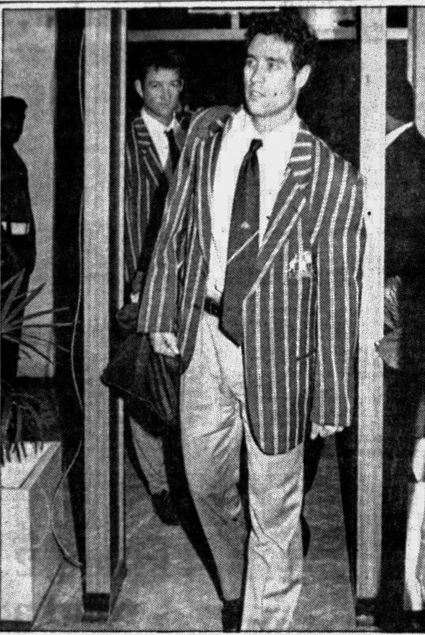
Australian cricketer Michael Bevan passes through the metal detector on arrival at the Colombo International Airport on Aug 21. In the background is Mark Waugh.