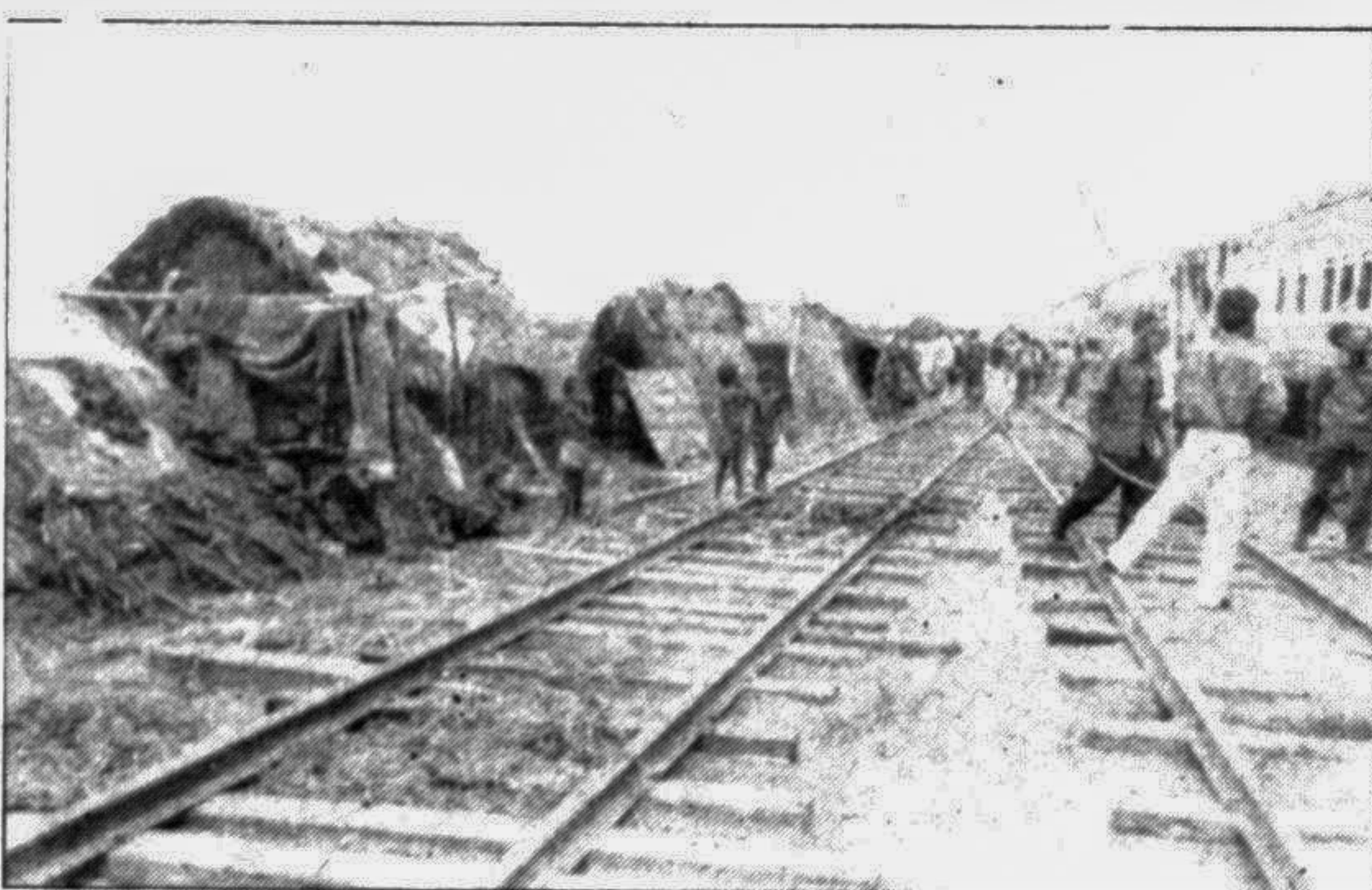
COMMON DESTINATION: The victims of river erosion often find shelter by the side of the railway stations with make-shift dwellings. The picture was taken last week at Bahadurabad ghat railway station in Jamalpur district.