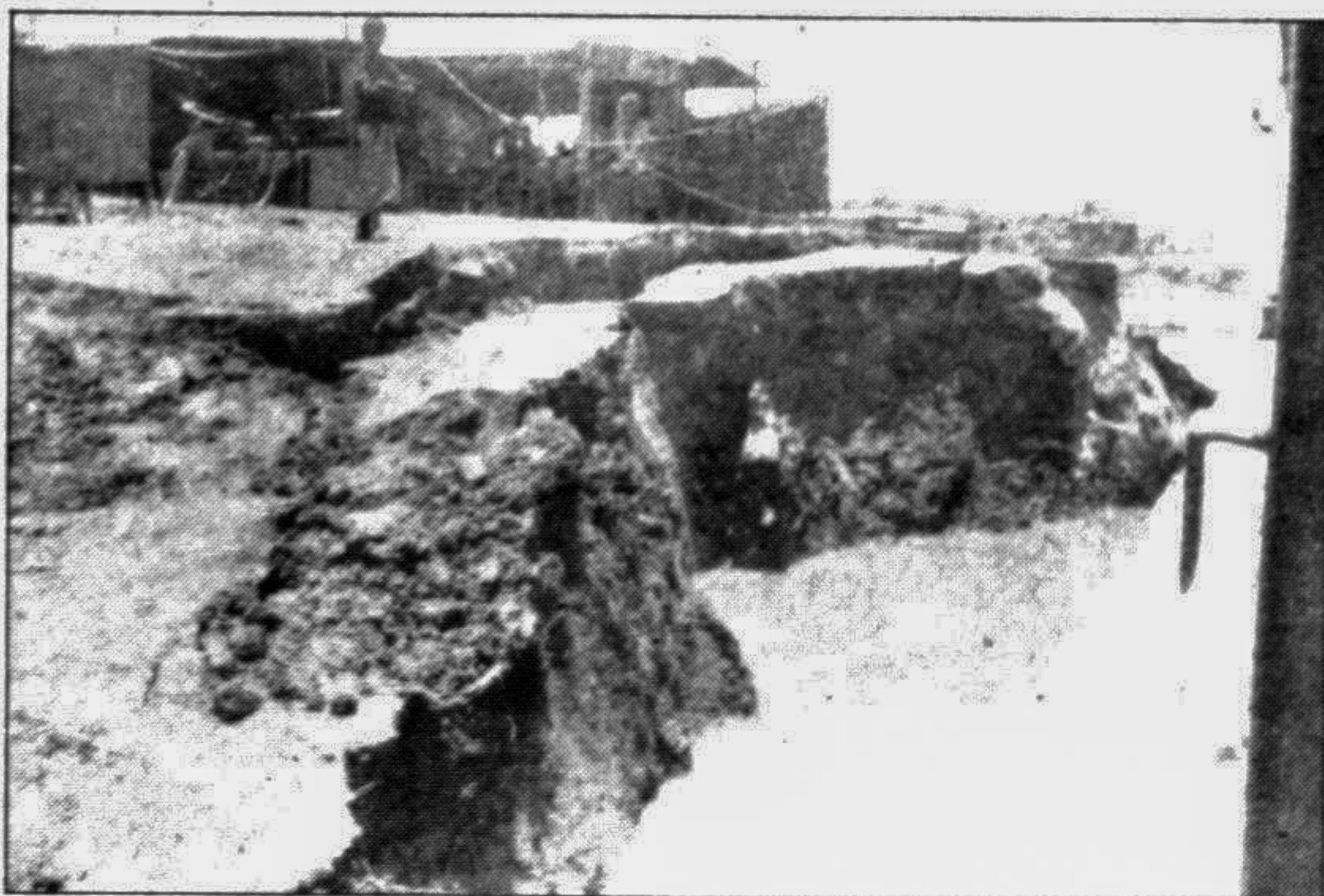
The devastating erosion continuing at Bahadurabad ghat in Jamalpur district.

On the day of occurrence, Jolli, 9, daughter of Mohammad Ali and Aina, 8, daughter of Noor Mohammad, both from same village were playing during rains under an open tin shade house when lightning suddenly struck both of them and died.