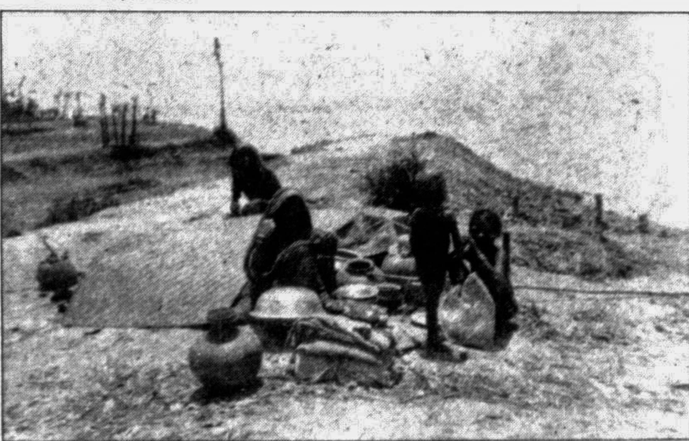
A Jamuna river erosion affected family has taken shelter on Harindara flood control embankment at near Bahadurabad ghat. The family lost the last portion of land in the recent attack of erosion. The devastating erosion continuing at Bahadurabad ghat in Jamalpur district.