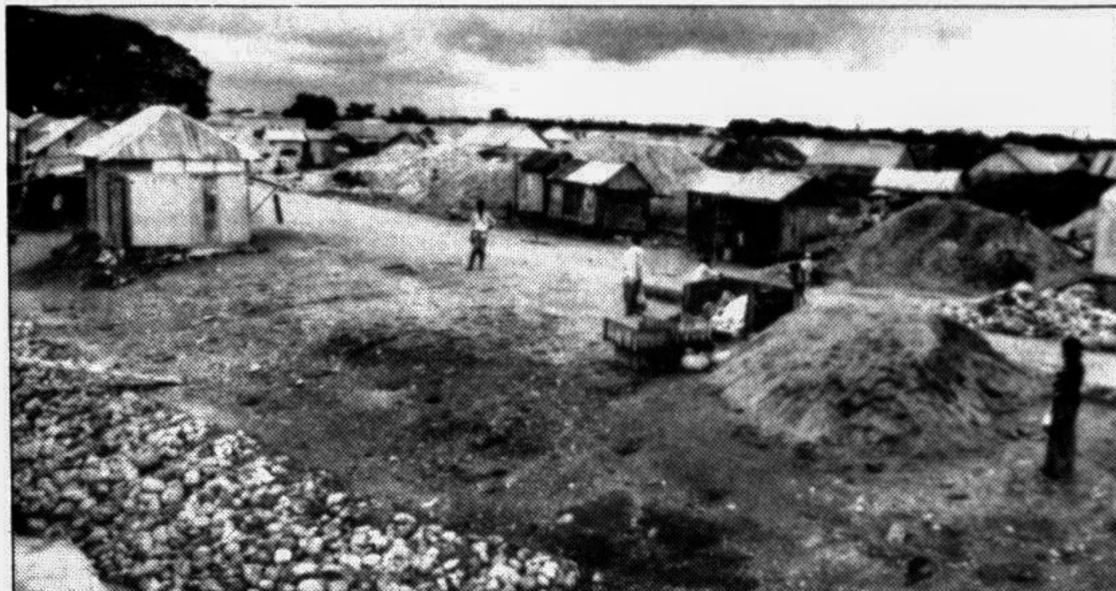
The kutcha road from the Dhaka-Chittagong highway leading up to the ghat just by the river. The three youngsters parked their vehicle somewhere on this road, according to local people.