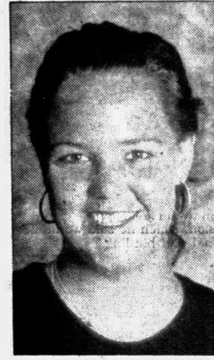
Lindsay Davenport (American tennis player) 'She is the greatest probably that's ever lived and I'll always have this no matter what happens.'