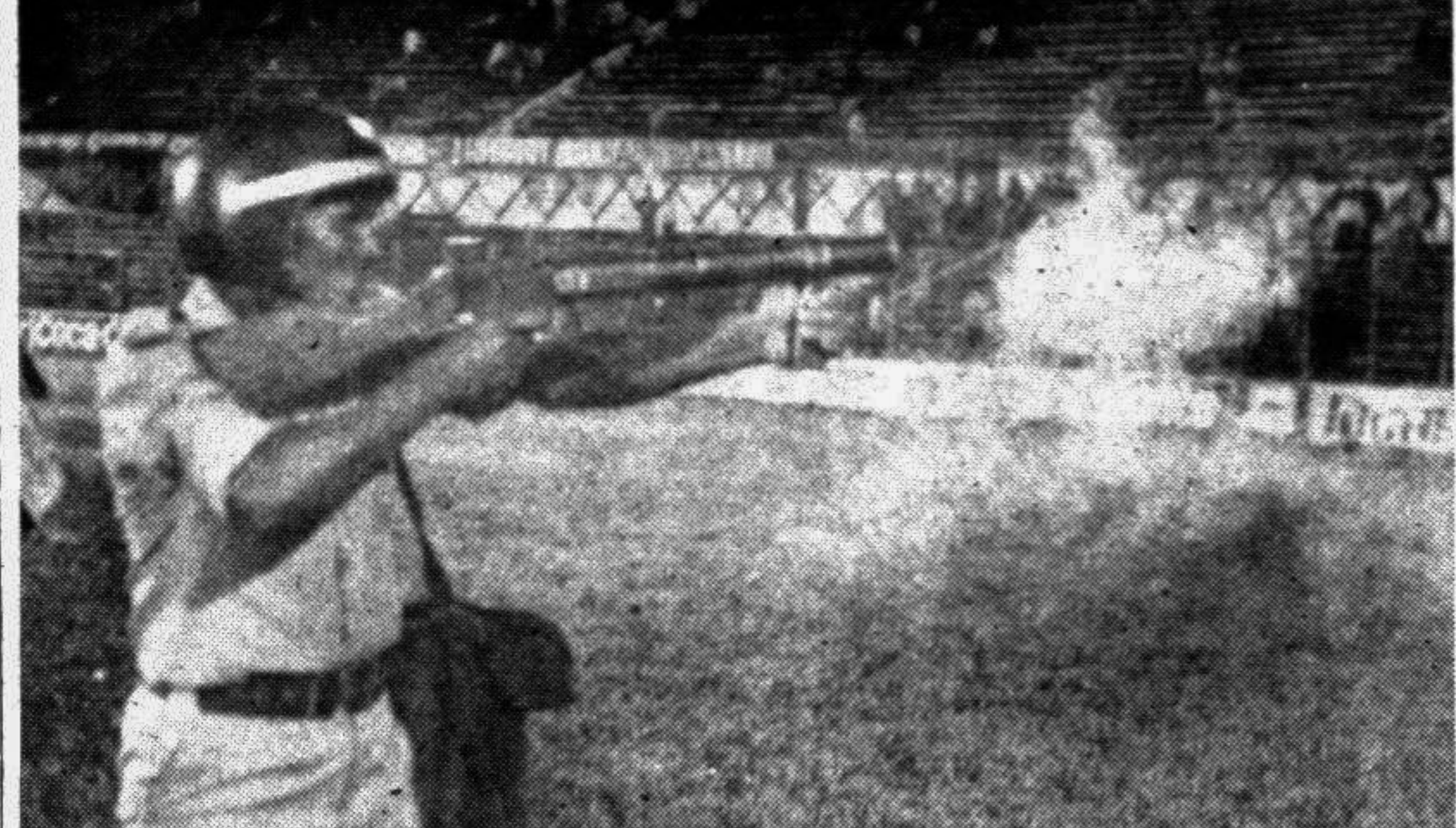
Police lobbed tear gas shells to bring down the crowd under control at the Dhaka Stadium yesterday.

The furious fans, offended by the way they were cheated at the cost of their expenses, vented their anger pelting stones and dislocating the chairs at the VIP stands. Some even tried to break open the fence before police jumped into the action to quell the situation.