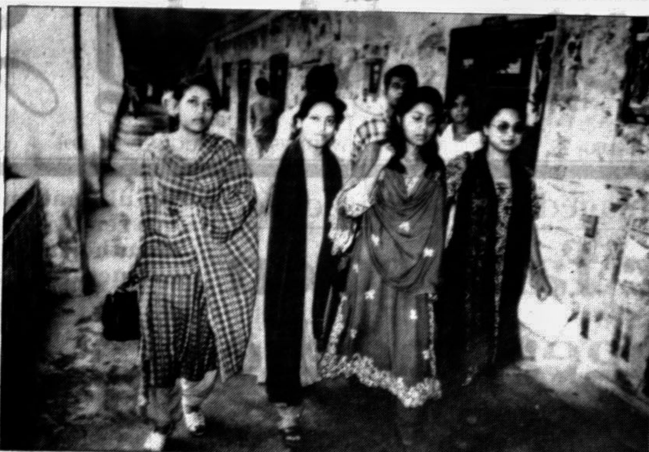
Dhaka University students who turned up for classes yesterday were unable to do so in face of an impromptu strike called by the Jatiyatubadi Chhatra Dal (JCD), the student wing of BNP, protesting Monday night's incident on the campus.