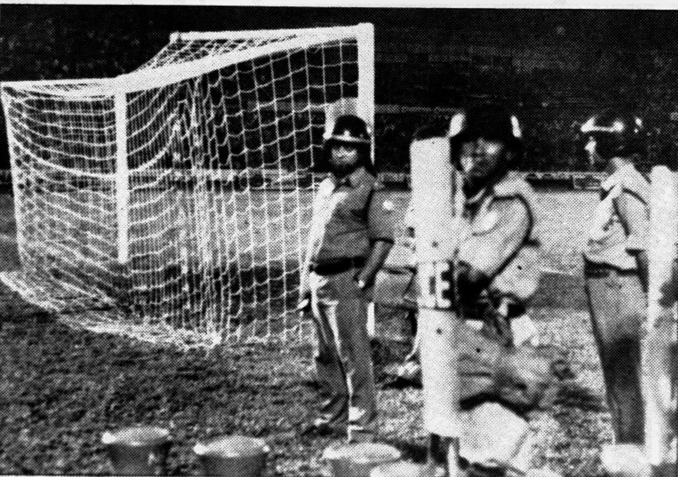
Police observing the situation at the Dhaka Stadium last evening when violence broke out in the galleries during football match yesterday.