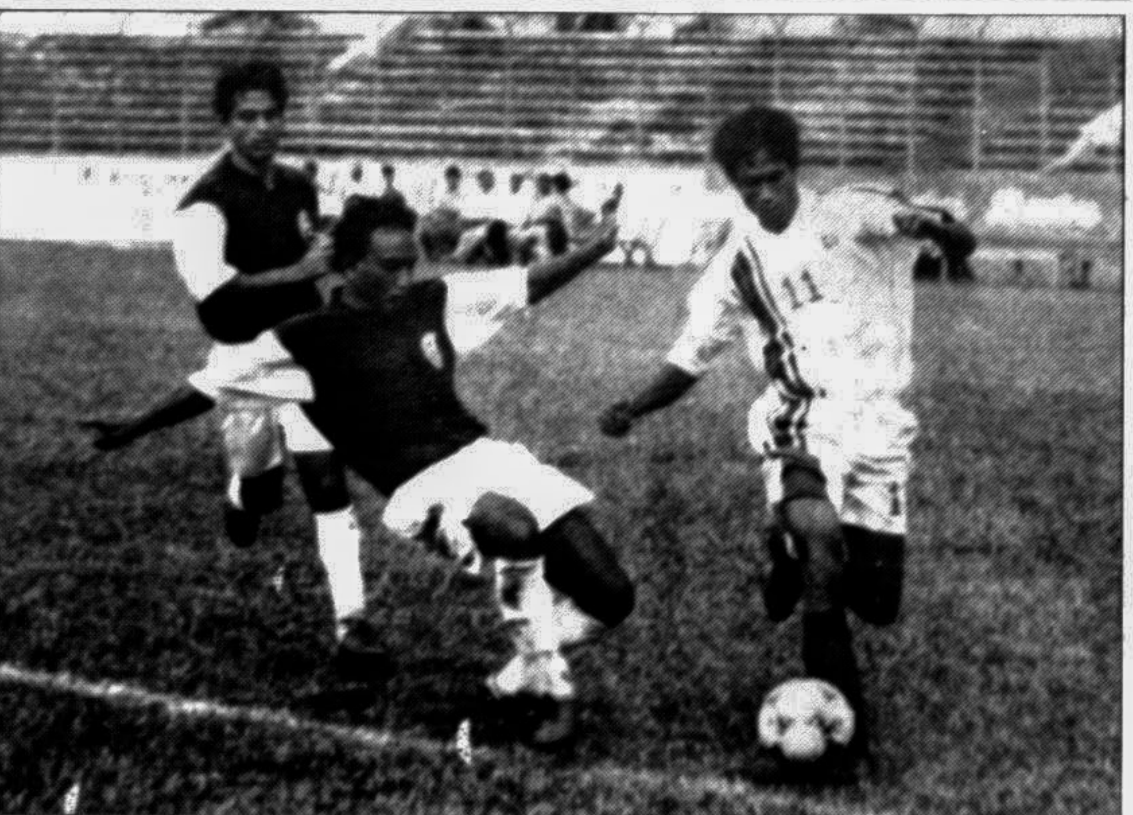
An action from yesterday's Danish First Division football league match between Sadharan Bima and Police at the Dhaka Stadium. Bima won 2-1.

First Division football league: Venue: Dhaka Stadium Wari Club vs PWD SC (4pm)