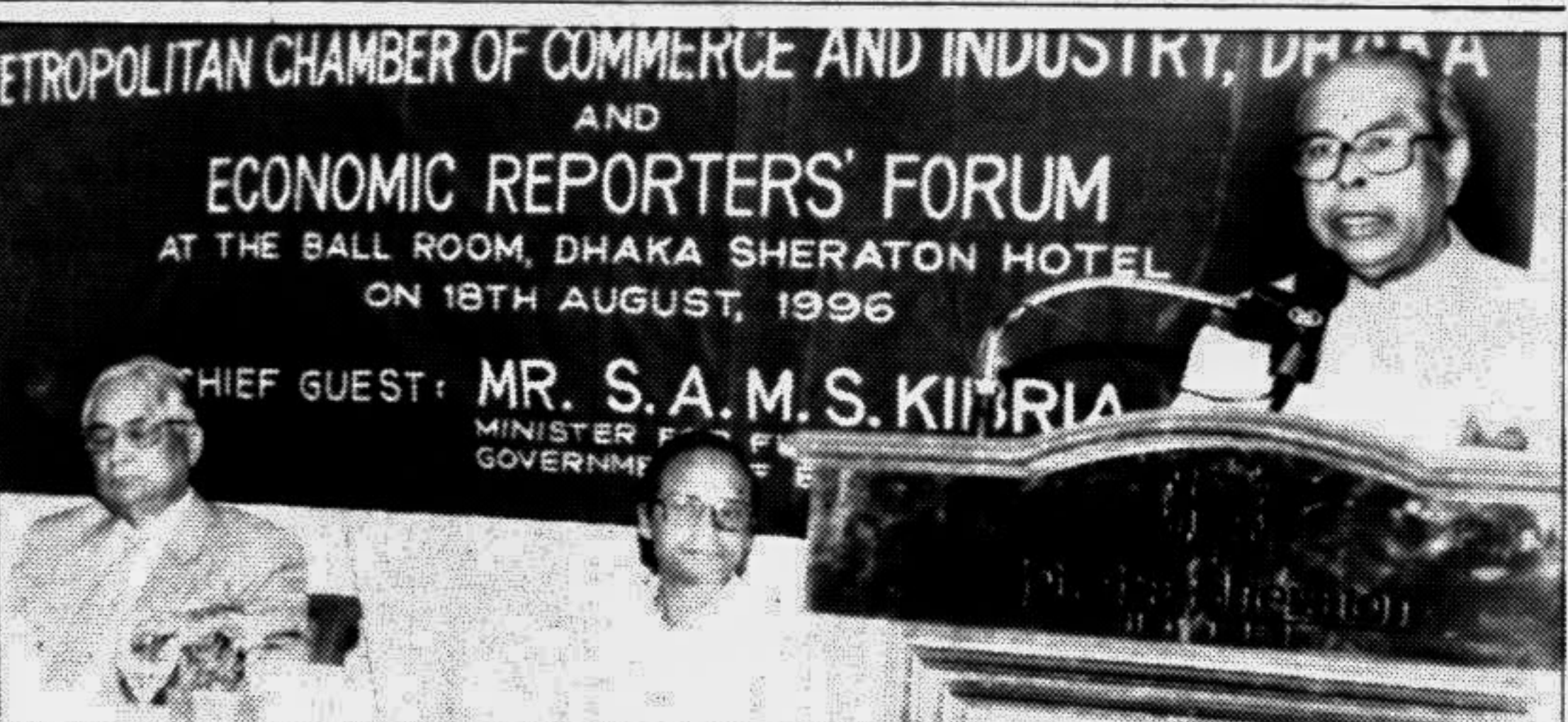
Finance Minister SAMS Kibria addressing as chief guest the seminar on 'Budget for 1996-97 and Reforms Programme', jointly organised by the Metropolitan Chamber of Commerce and Industry and Economic Reporters' Forum in the city yesterday.

He was satisfied over his current visit and hoped that there shall be more regular and annual exchanges between the two governments at the secretary level.