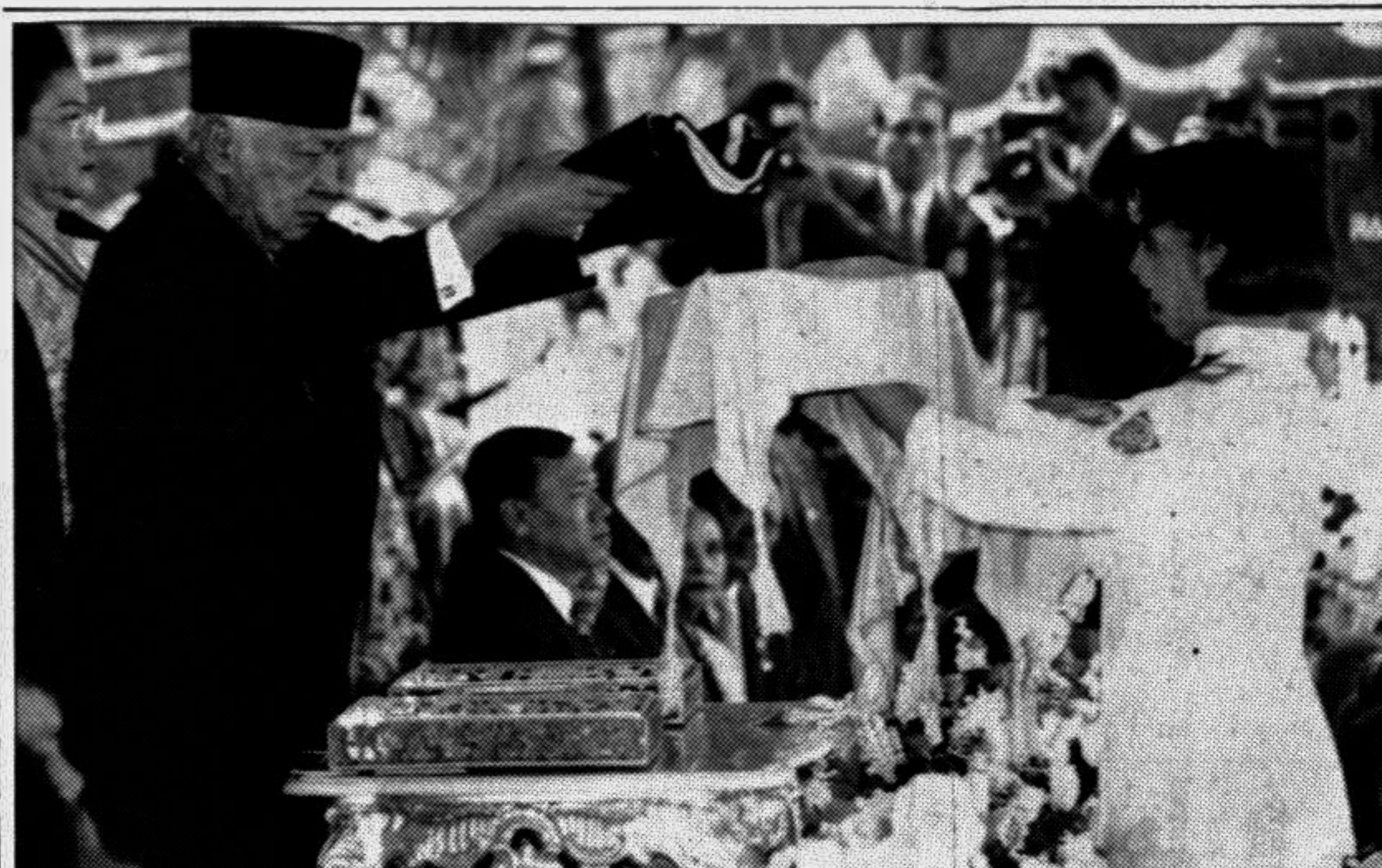
Indonesian President Suharto hands over a replica of the red and white national flag to model students, before it was hoisted in front of the presidential palace during Independence Day celebrations in Jakarta yesterday.