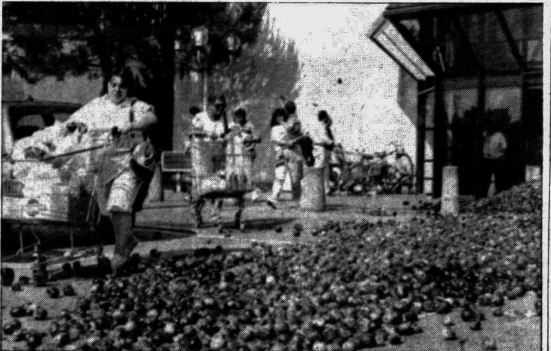
Clients of Leclerc supermarket at Montauban in France on Friday leave the supermarket where hundreds of farmers unloaded tons of peaches and nectarines to protest against their dropping sales and the bad quality of the supermarket products.

The growth in retail prices during the first seven months of the year reached 6.9 per cent, and the consumer price index was 9.1 per cent, compared with the same period last year.