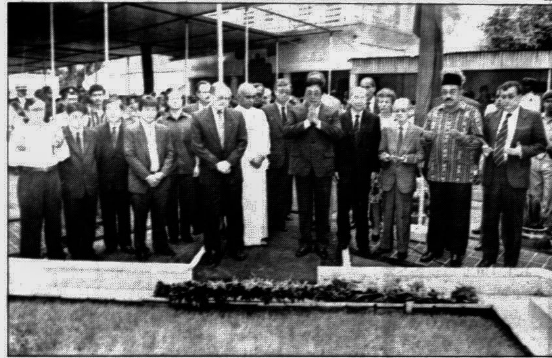
Foreign diplomats in Bangladesh placed wreaths at the mazar of Bangabandhu Sheikh Mujibur Rahman in observance of the National Mourning Day Thursday.

The organisations and educational institutions which observed the day included University of Chittagong, Chittagong Medical College, Bangladesh Boudha Kirti Prachar Sangha, Sheikh Russel Smriti Pathagar, Bangladesh Muktiyoddha Sangsad, Bangladesh Chhatra League, its different