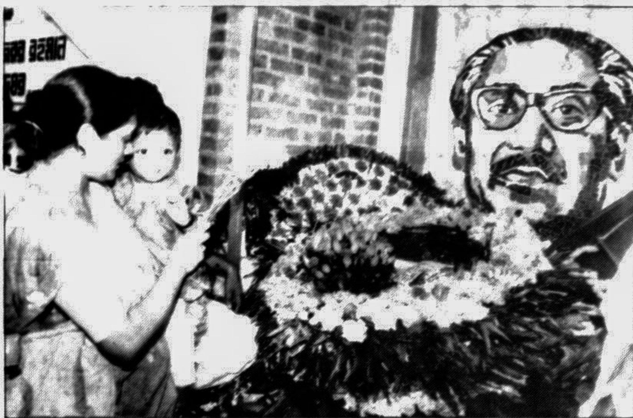
Members of the public thronged to the Bangabandhu Memorial Museum at Dhanmondi on the National Mourning Day on August 15 to pay homage to the Father of the Nation Bangabandhu Sheikh Mujibur Rahman.

The registration period for DV-97 ended March 12 and no further applications will be accepted this year. No date has been set for DV-98 registration, the press release said.