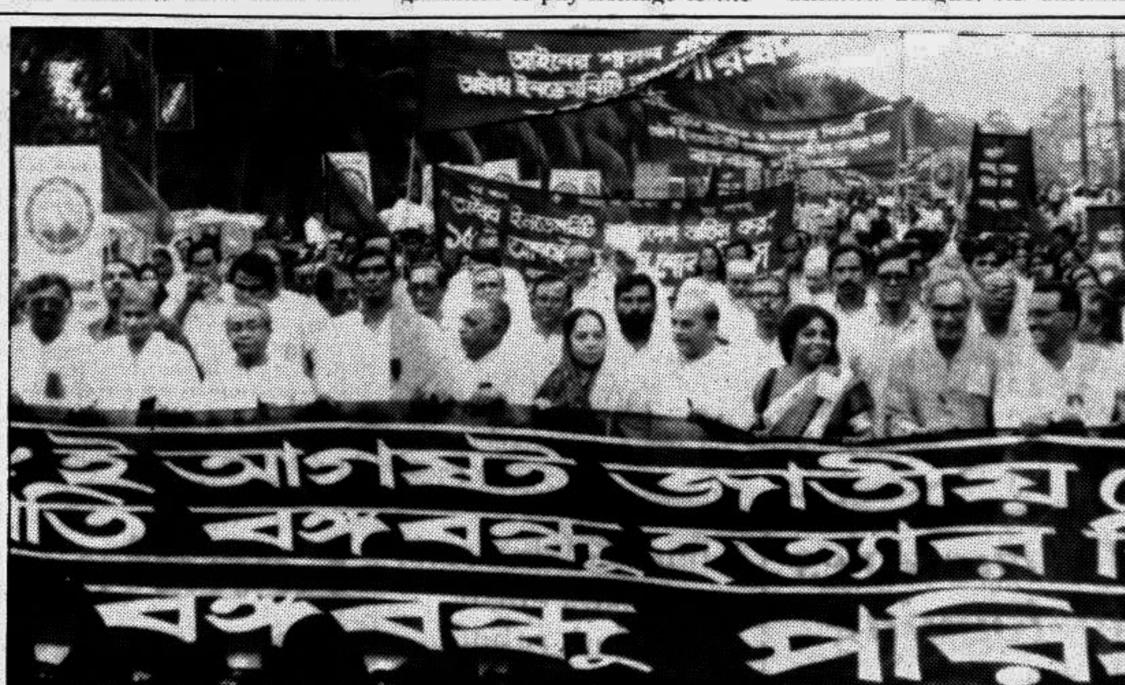
Bangabandhu Parishad brought out a mourning procession commemorating the 21st anniversary of death of Bangabandhu Sheikh Mujibur Rahman in the city on Thursday.