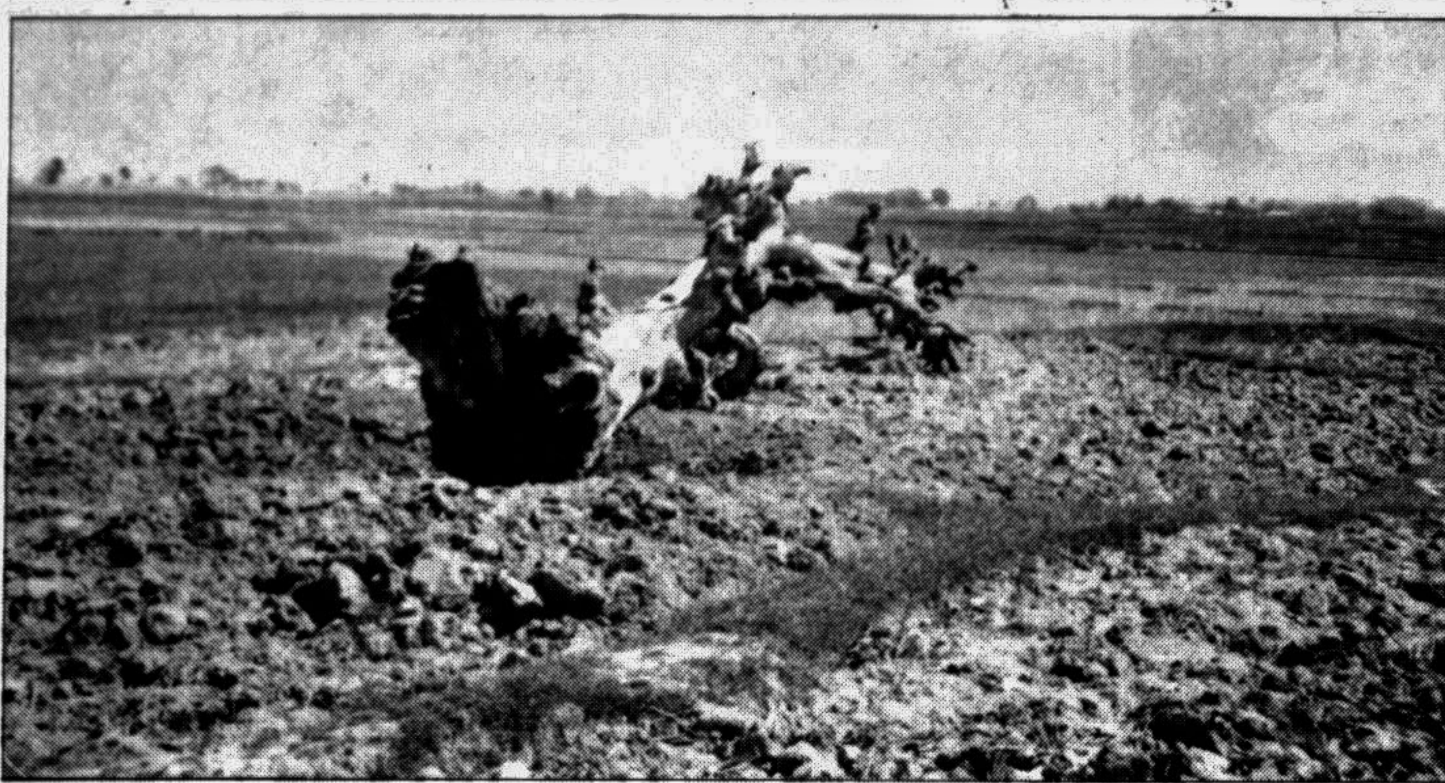
RAJSHAHI: Trees on vast tract of land have been cut off but no compensations are being made. As a result soil fertility is decreasing alarmingly. Deforestation is considered as the main cause of environmental imbalance and climatic changes.

It is widely felt that the authorities concerned should expedite loan sanctioning for the oilmen of the district to save their hereditary profession from extinction.