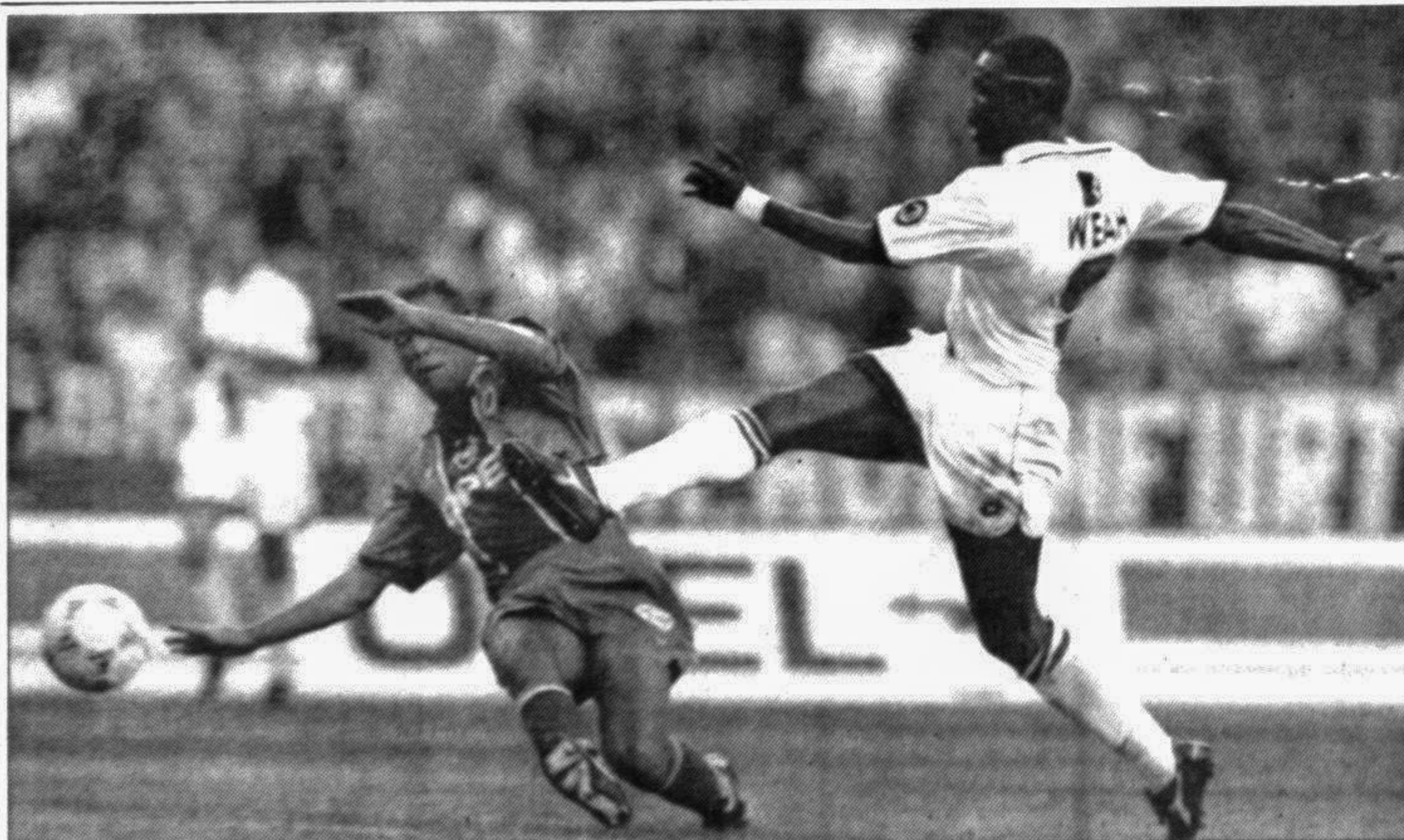
AC Milan's George Weah fires the ball past a sliding Alain Roche of Paris St Germain during the three-team Opel Masters' tournament in Berlin on August 12. PSG won 2-1. The third team is Bayern Munich.

This contrasted with an average operating profit of 2.24 million pounds in the Premier league. Manchester United, which last season won the league title and the FA Cup double for a historic third time, was the country's most profitable club in 1994/95, when it earned pre-tax profits of 20 million pounds.