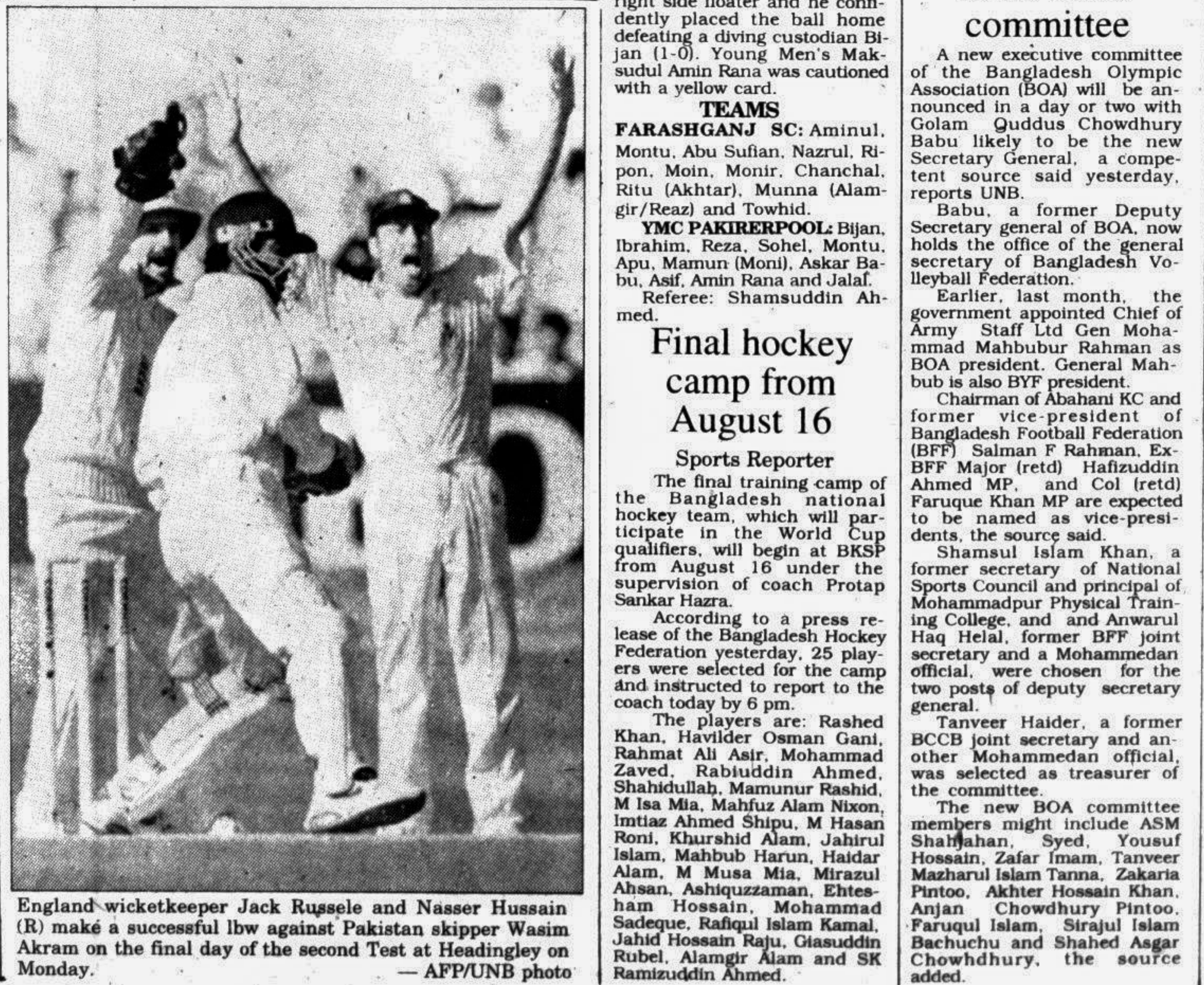
England wicketkeeper Jack Russele and Nasser Hussain (R) make a successful lbw against Pakistan skipper Wasim Akram on the final day of the second Test at Headingley on Monday.