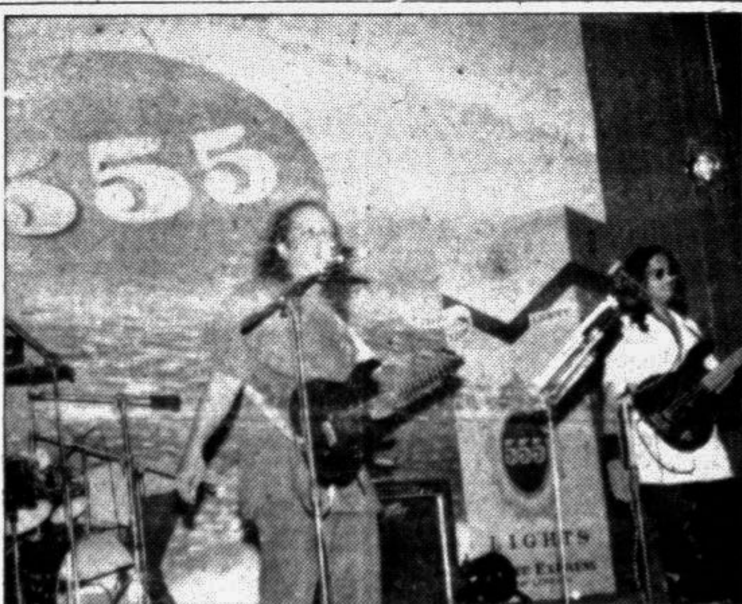
The band, LRB performing at the 555 Lights concert in Chittagong recently.