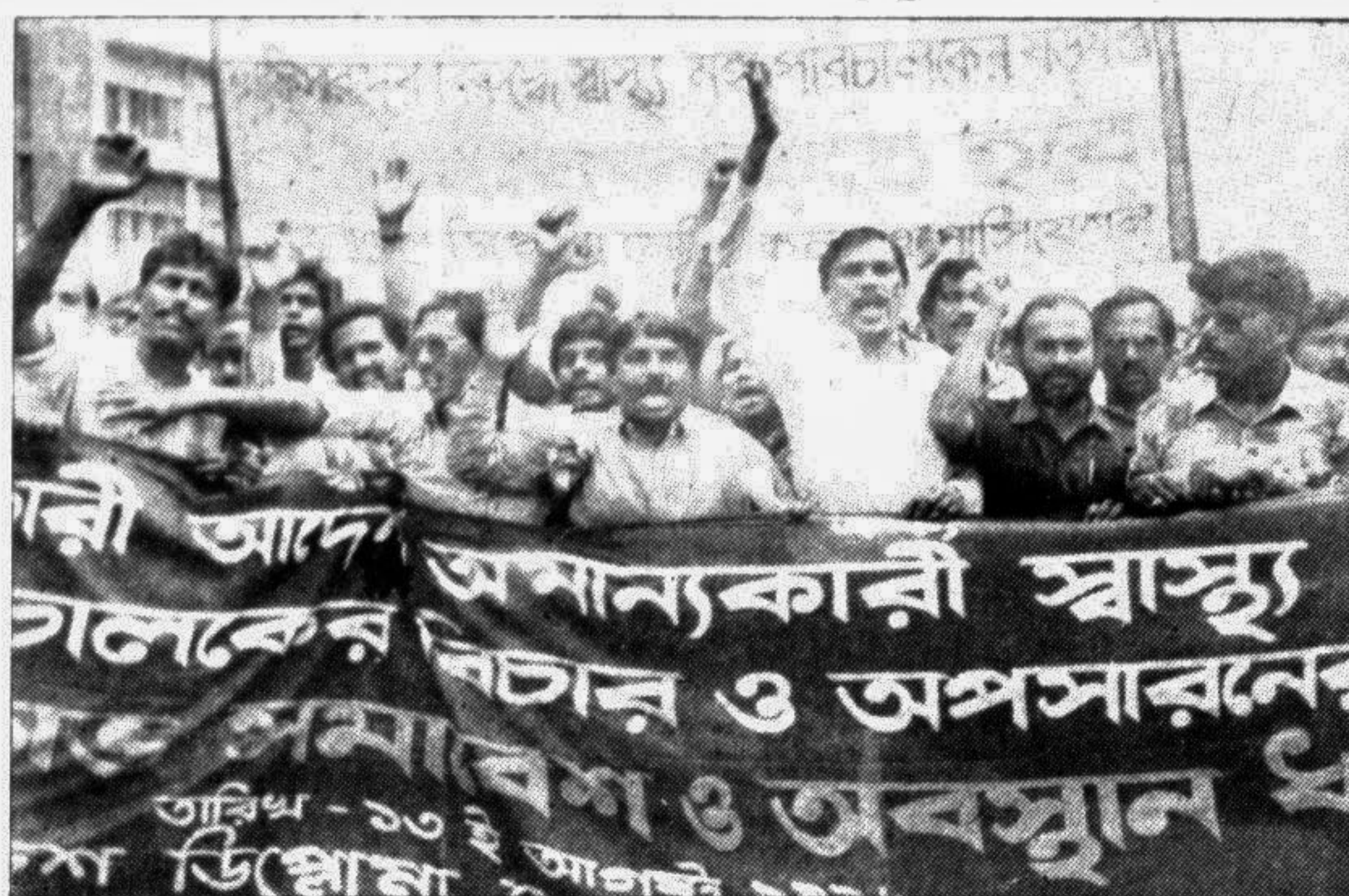
Bangladesh Diploma Medical Association yesterday brought out a procession in the city in support of their various demands.

In Bangladesh, about 85 per cent of total calorie come from cereals alone and only 4.4 per cent and 2.7 per cent come from fats and oils. Fruits and vegetables provide only one-fifth and pulses and beans provide only half of the desired quantity.