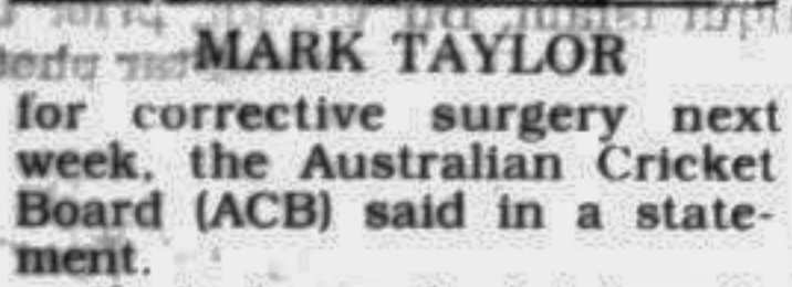
MARK TAYLOR for corrective surgery next week, the Australian Cricket Board (ACB) said in a statement.

MELBOURNE, Aug 12: Australia Test captain Mark Taylor today pulled out of this month's tour to Sri Lanka to undergo surgery on a back injury, reports Reuter. Taylor aggravated his back during recent pre-season training and will enter hospital