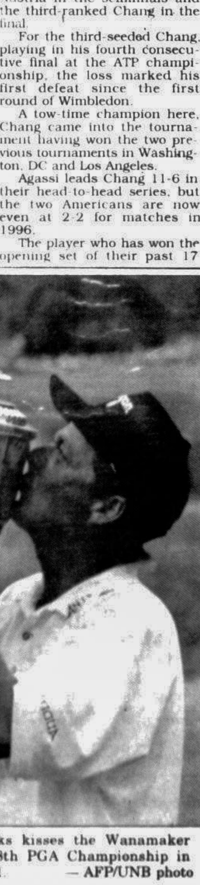
American golfer Mark Brooks kisses the Wannamaker Trophy after winning the 78th PGA Championship in Louisville, Kentucky on Aug 11.