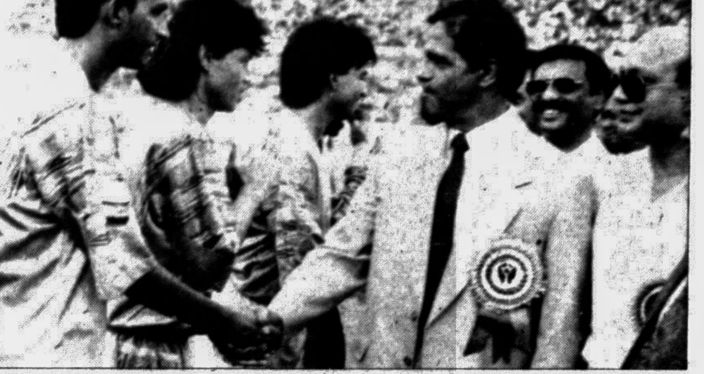
Abahani footballers being introduced to Home Minister Rafiqul Islam, Bir Uttam, prior to their league opener yesterday at the Dhaka Stadium.