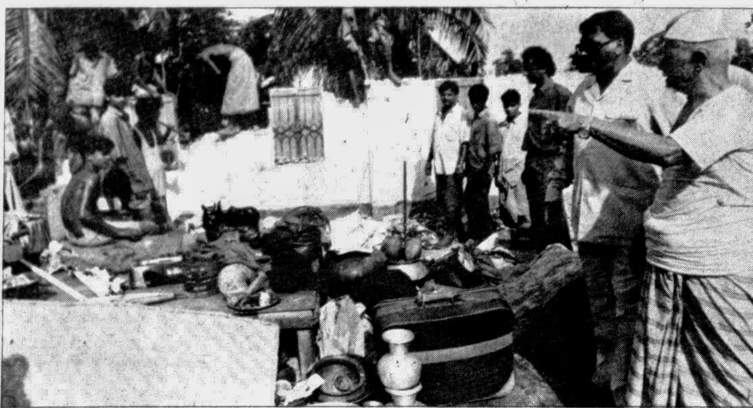
MUNSHIGANJ: Dhaida Union of Louhajang thana was recently completely eroded by Padma river. Hundreds of erosion-hit people are searching for safer shelters. Local MP Mizanur Rahman Sinha is seen visiting a number of affected families. It is to be mentioned here that no government relief has yet been distributed among the victims.

A young man of Nagormir-gonj village in Sadar thana surrendered the country-made pipe gun and ammunition.