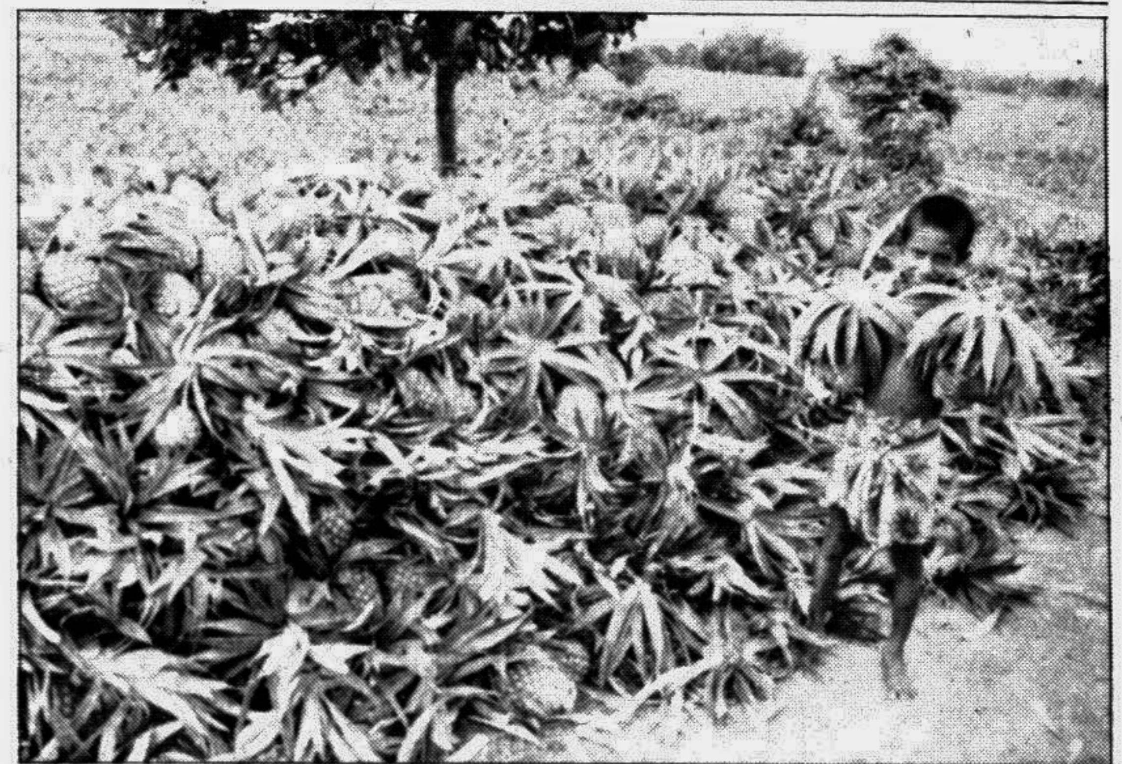
TANGAIL: Huge piles of pineapples are ready for loading on trucks as well as other transports for marketing in the capital city.

Economists and experts of the northern districts stressed the need for taking steps to set up subsidiary units of existing sugar mills like paper mills and distilleries to overcome the persisting financial crisis of the sugar mills and explore avenues to earn huge foreign exchange as well as to meet the prevailing country's acute paper crisis.