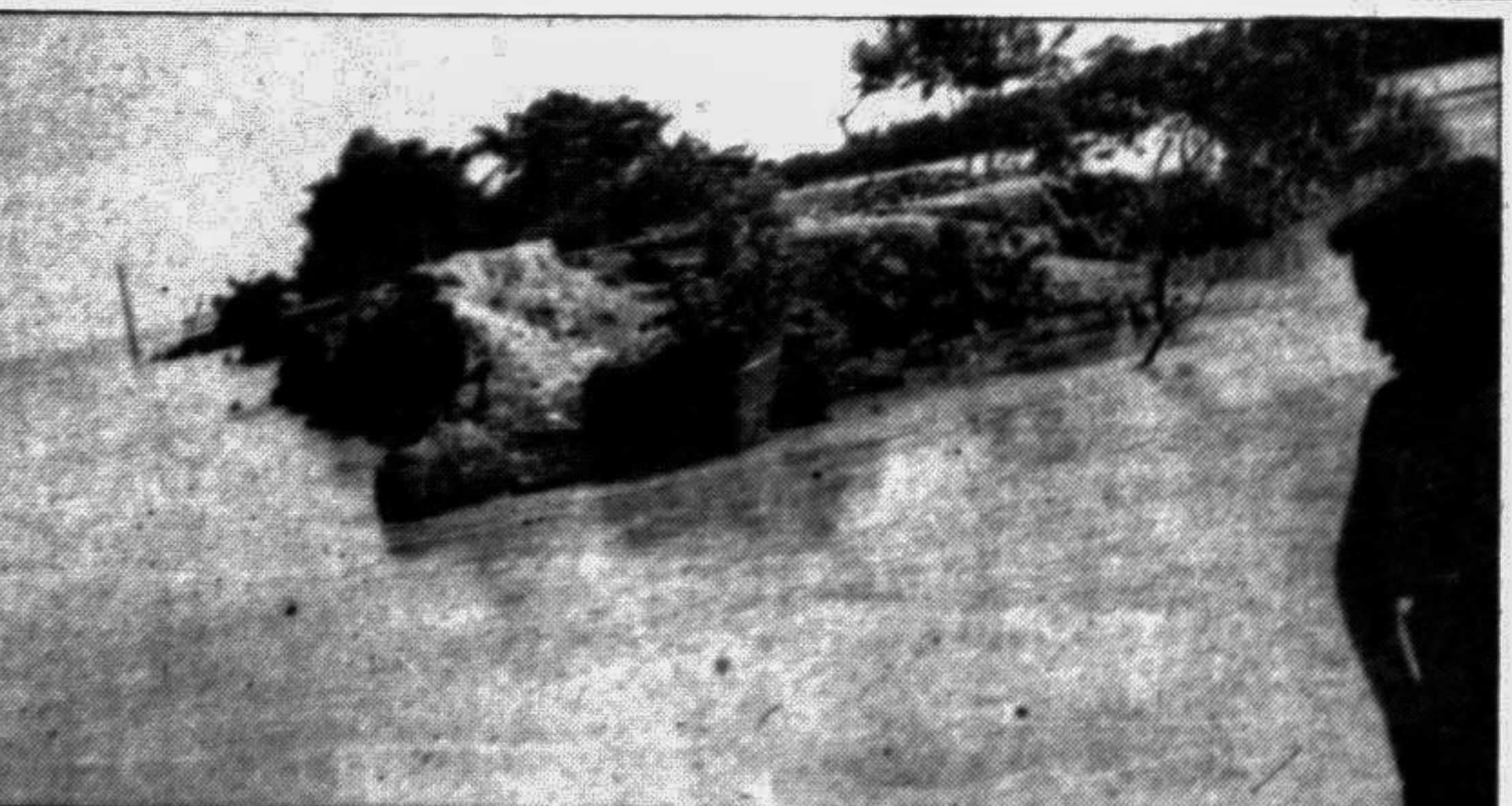
PABNA: A village within Bera thana face threat of erosion by river Jamuna which was still continuing.