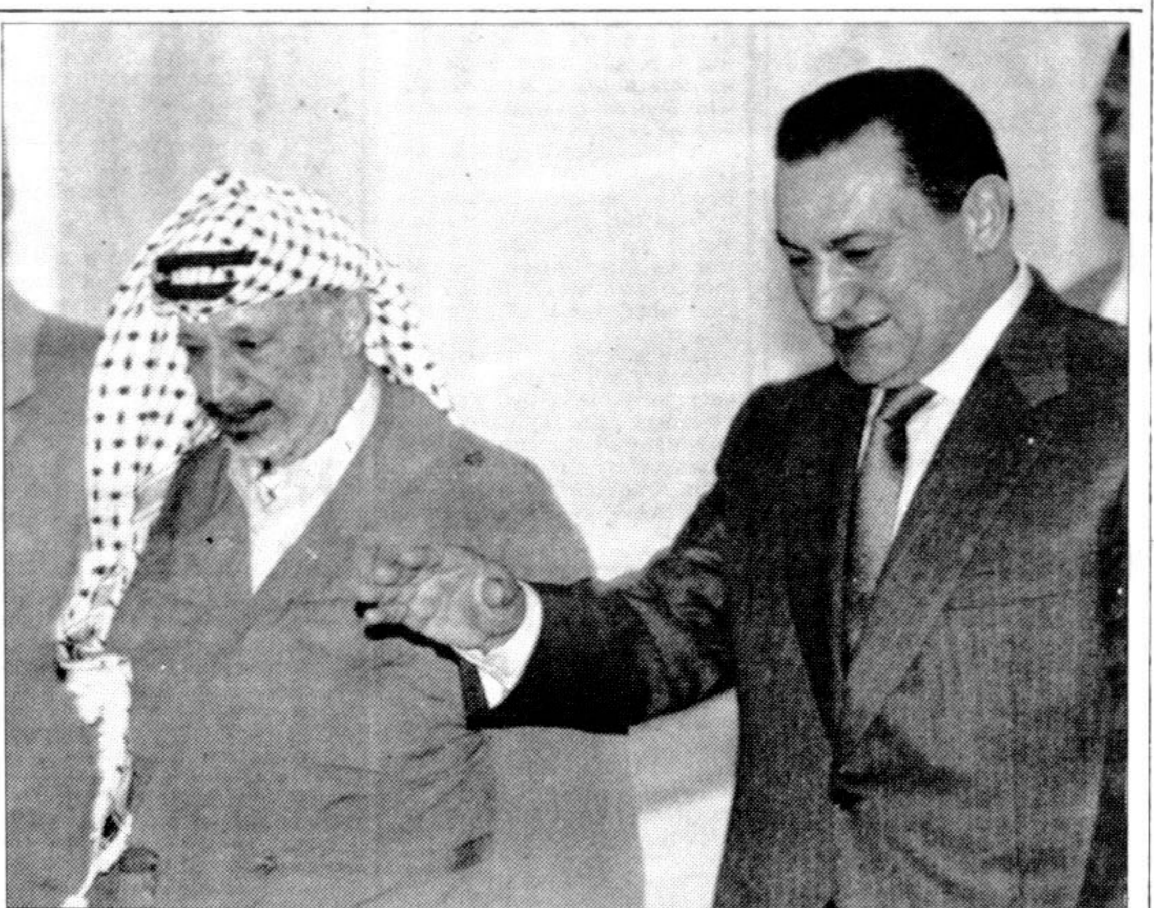
Egyptian President Hosni Mubarak (R) welcomes Palestinian President Yasser Arafat who arrived in Cairo yesterday for talks to advance the stalled peace process with Israel.