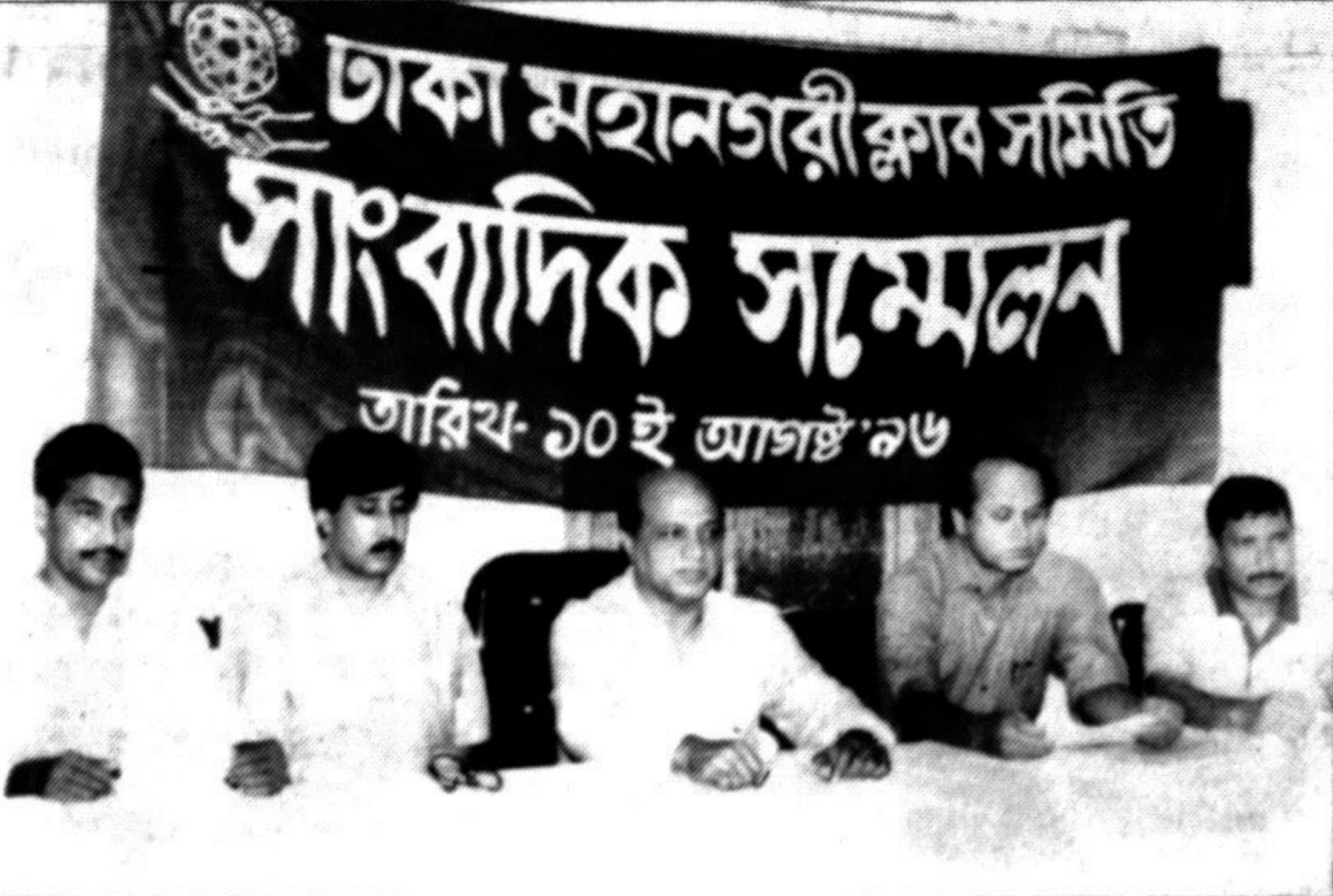
President of the Dhaka Metropolitan Club Association addressing a press conference at the NSC conference room yesterday.