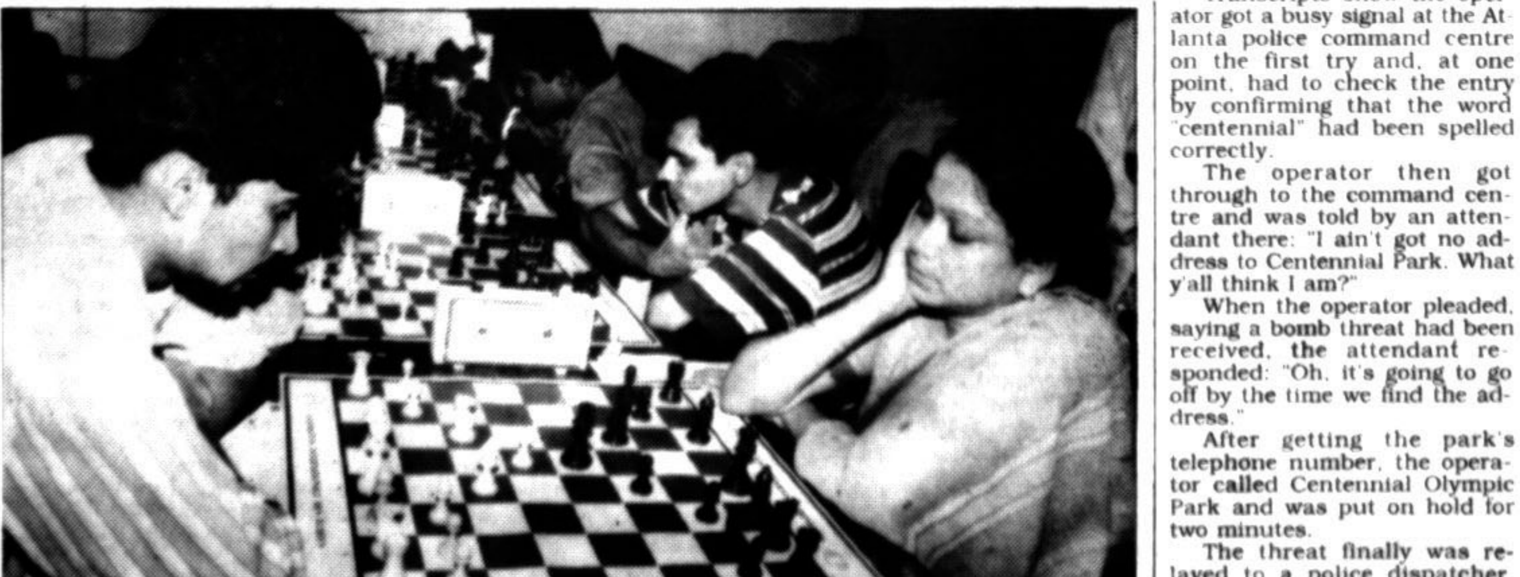
International Open Rating title-chasers engage in deep celebration at the NSC chess room yesterday.