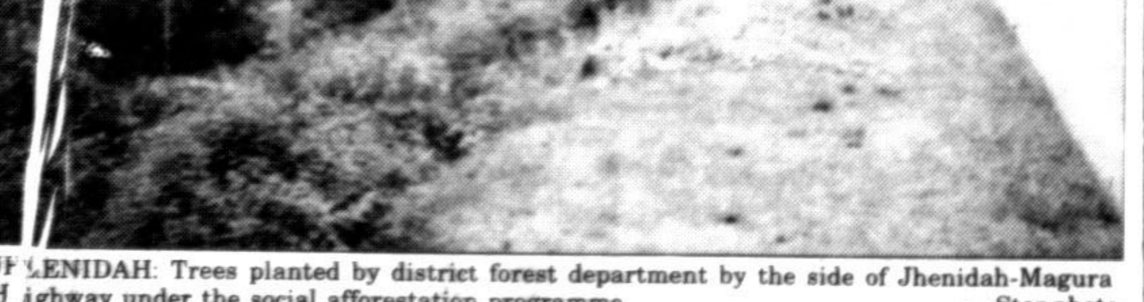
JHENIDAH: Trees planted by district forest department by the side of Jhenidah-Magura Highway under the social afforestation programme.

ACF told that only 52,000 saplings were raised from six nurseries including two central nurseries in six thanas of the district this year.