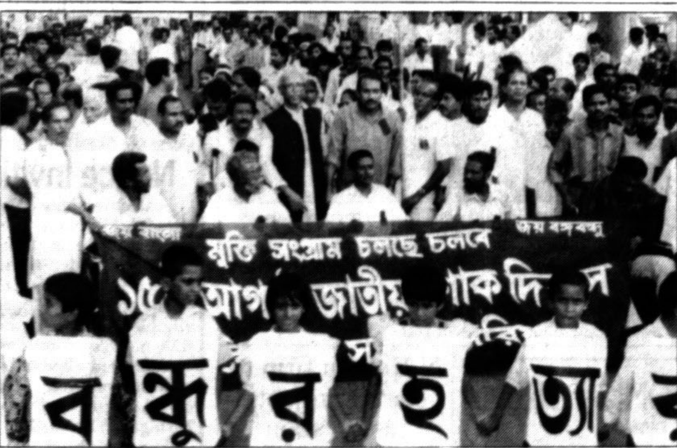
The Muktiyoddah Sanghati Parishad brought out a procession in the city yesterday as part of its programme in observance of the National Mourning Day on August 15.

CSE price index 473.60 (+41%) Market capital Tk 4315.52 cr Transactions in volume 36800 Transactions in value Tk 8141055 cr