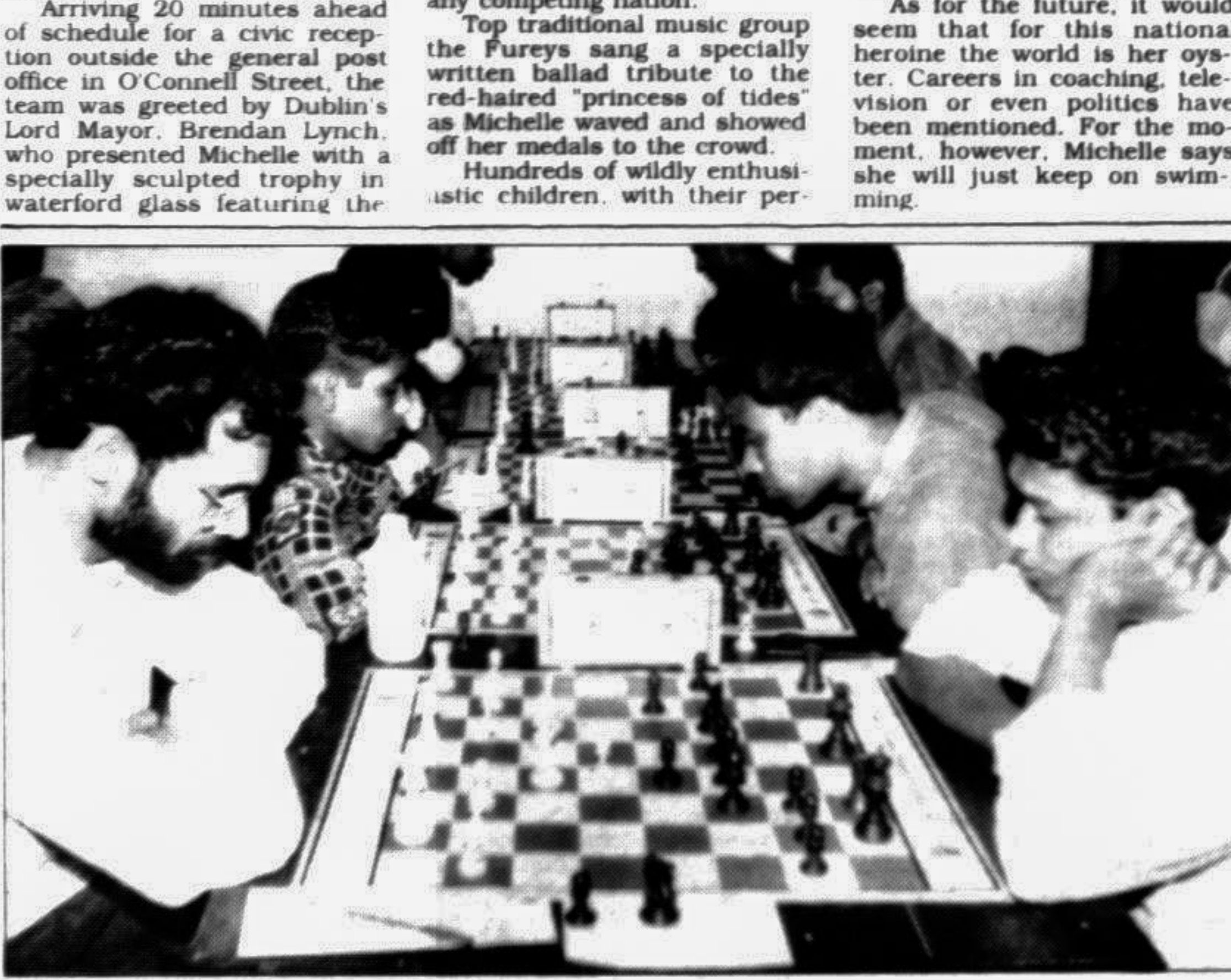
Matches of the Open International Rating chess tournament being played at the NSC chess room yesterday.

happens more reluctant parents in two, waved plastic tri-colours in the pouring rain.