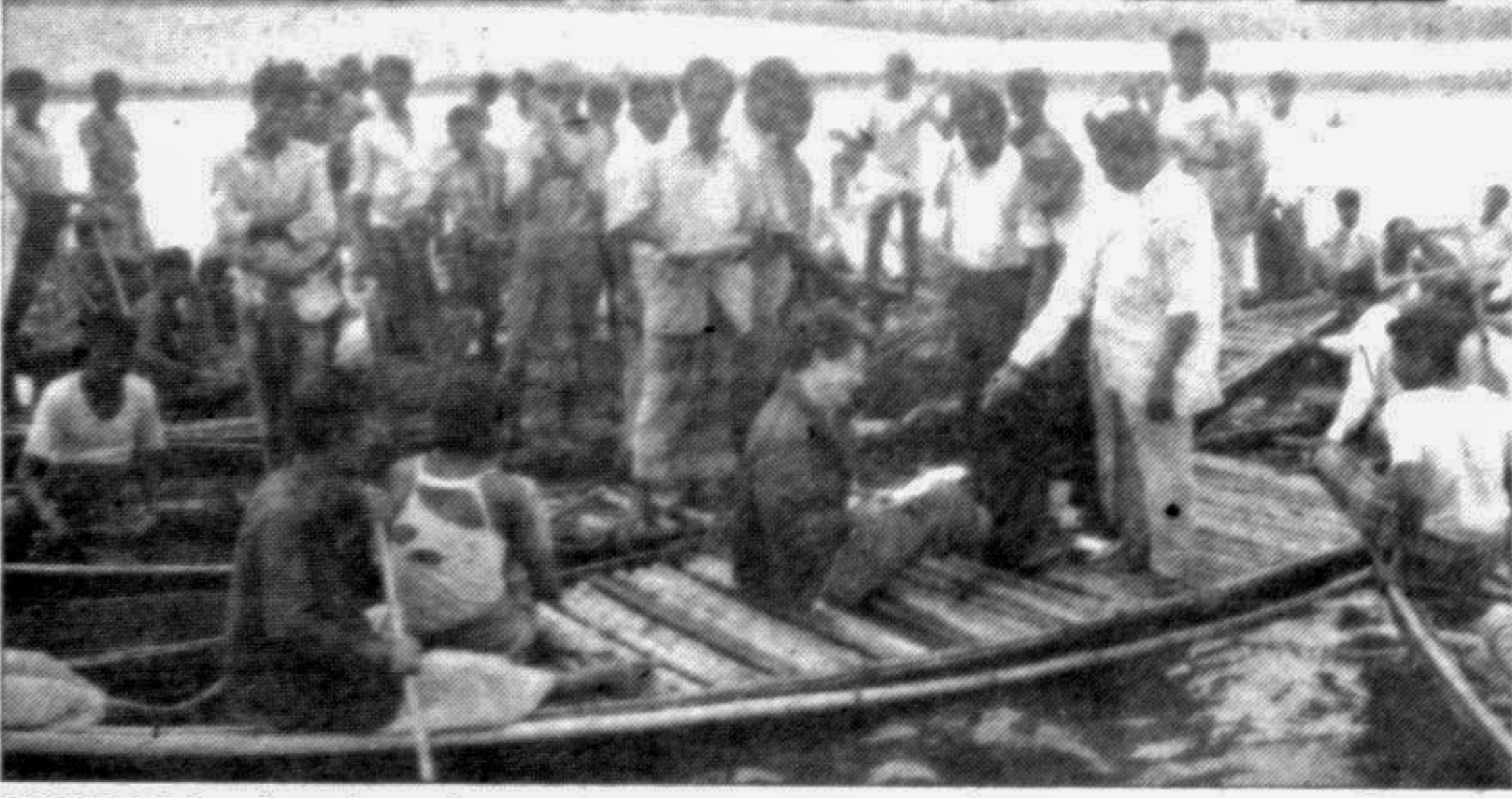
JESSORE : Local people working to dewater and re-excavate the silted portion of river Bhairab under segments area (above). Representatives from WFP seen talking to beneficiaries of segment area of river Bhairab (below).

will start in current fiscal and proposal has been made to allocate wheat worth 1000 mt to re-excavate 5 kilometre covering the area of 21 hectares. A total of 566 beneficiaries including poor and landless fishermen will be benefited on completion of all the five segments. The number of beneficiaries, with completion of the work of segment no 4 in last fiscal, comes to 400. According to statistical report actual fish production, achieved in 1992-93, was 21