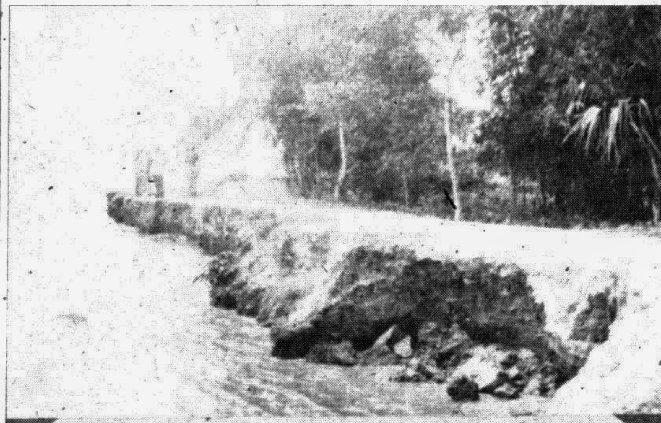
FARIDPUR : A scene of erosion by the Padma at Abdul Gafur Haridhar Dangi under Char Bhadraran thana in Faridpur district.

Besides, the mills also owe to Agrani Bank Taka one crore twenty lakh for productive sector. The mill has to pay a large amount of money as electric bill which is lying outstanding, sources added.