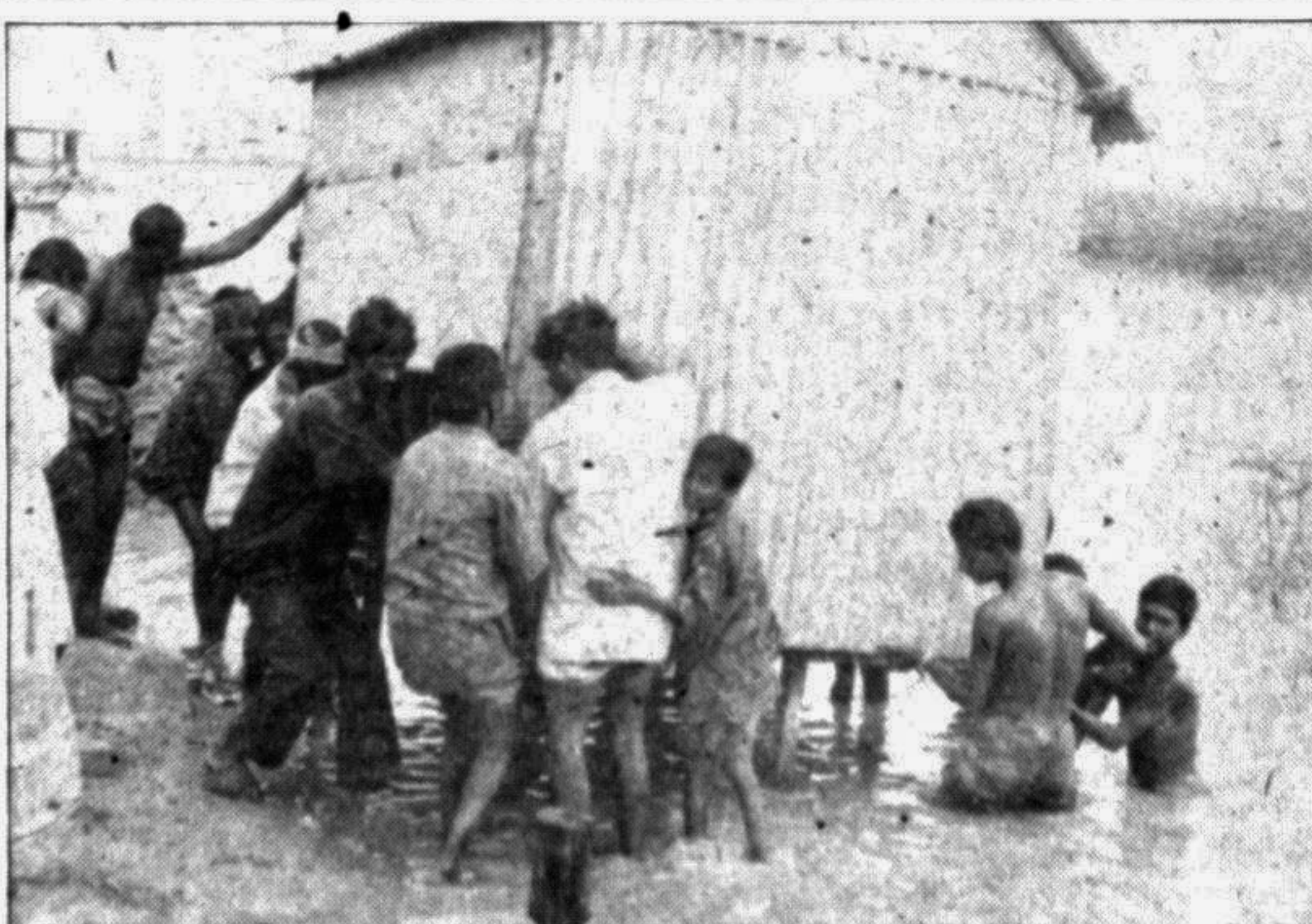
People removing a shop from near a river bank area in a village of Tangail district recently. Huge properties were washed away by the recent flood in the district.

The BINA sources said the per acre production of Binashail is 20 per cent higher than its parent variety and well adapted in adverse climatic condition.