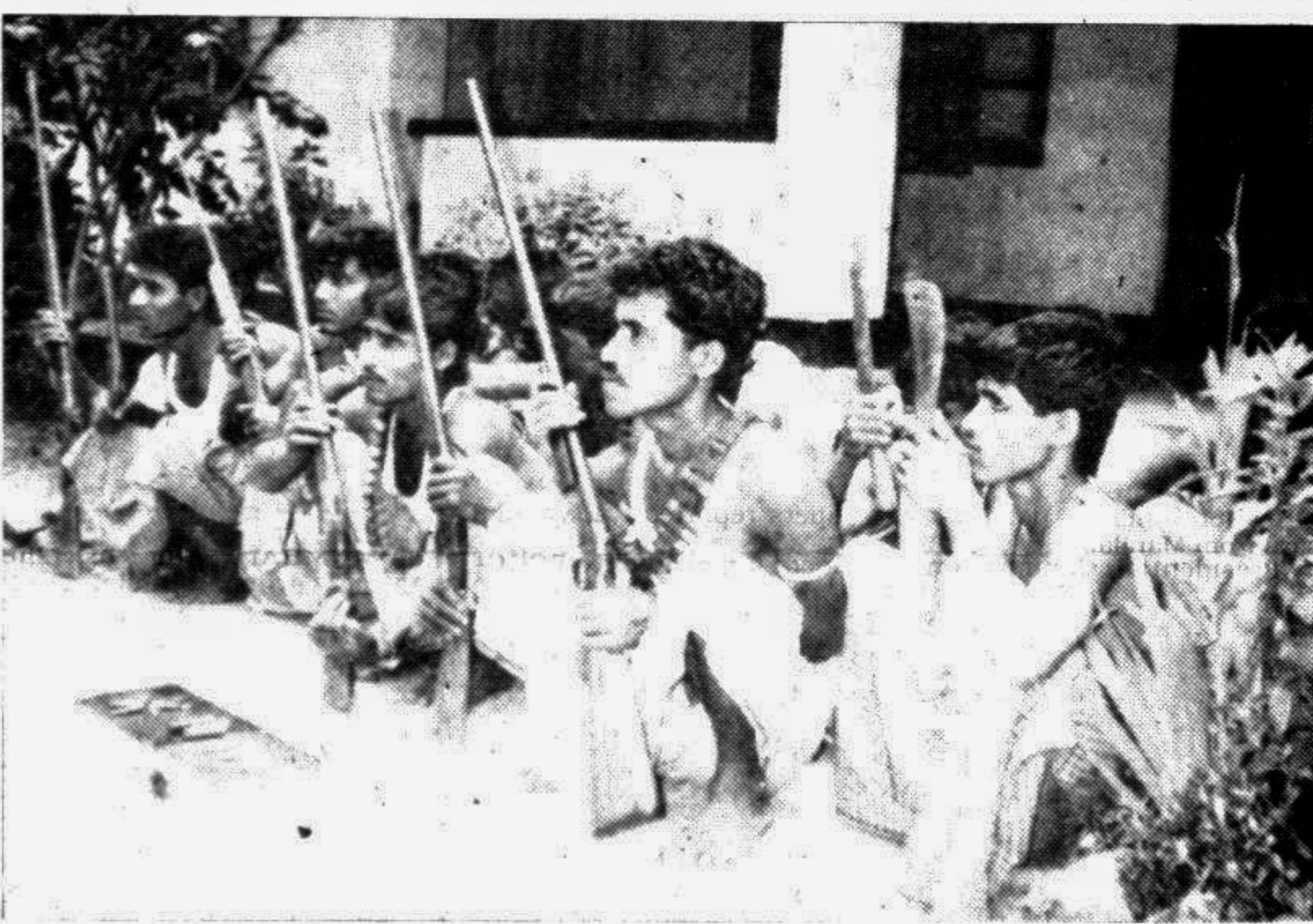
COX'S BAZAR : Chokoria thana police arrested 10 alleged dacoits with illegal weapons in a raid from Fultala village recently.

and the actual achievement was same. The report also shows that harvesting in 1993-94 was 5000 fingerlings while target was 7000. In 1994-95 it was 24,000 while the target of harvesting was 23,700 fingerlings. The figure for the last fiscal was not readily available with the concerned section. Reports also say that the beneficiaries are being provided training on fish culture orientation by DFO and IFO. Besides, regular maintenance