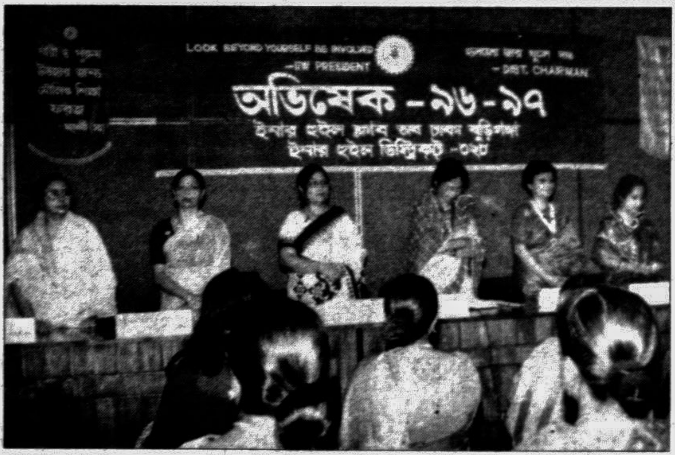
The installation ceremony of the office-bearers of the Inner Wheel Club of Dhaka Buriganga was held at ICDDR,B auditorium in the city yesterday.

Applications should be sent to: The Advertiser, Box No. A-818 C/o, The Daily Star, House No. 11, Road No. 3, Dhanmandi R/A, Dhaka -1205 by August 25, 1996.