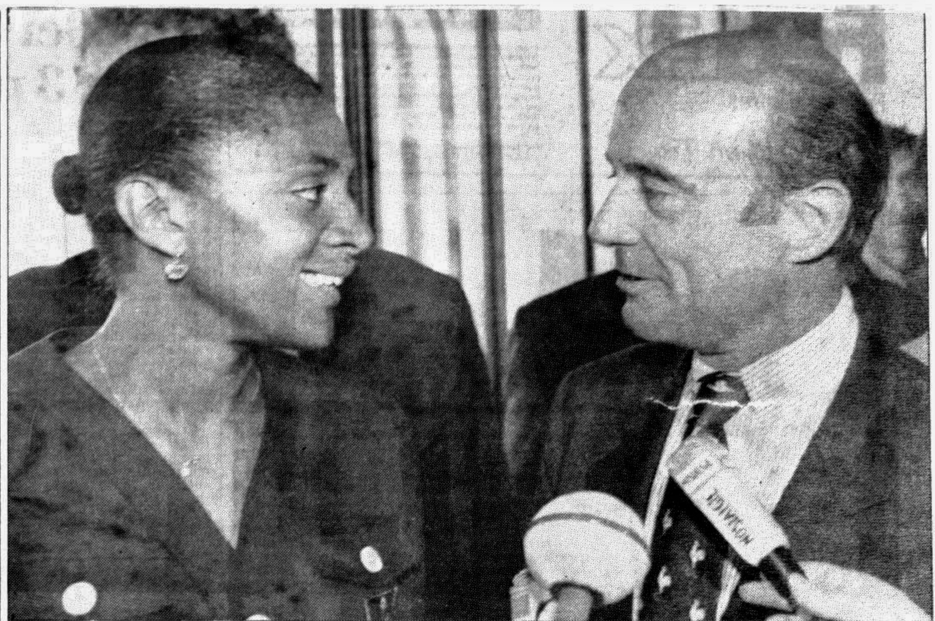
French Prime Minister Alain Juppe (R), who rushed at the Charles de Gaulle-Roissy airport to welcome the Olympic heroes on August 6 having a light moments with Marie-Jose Perec (L), the gold medalist in women's 400m and 200m.

Officials at the US embassy in Bucharest said they had no indication whether the two previously little known Romanian swimmers had applied for immigration.