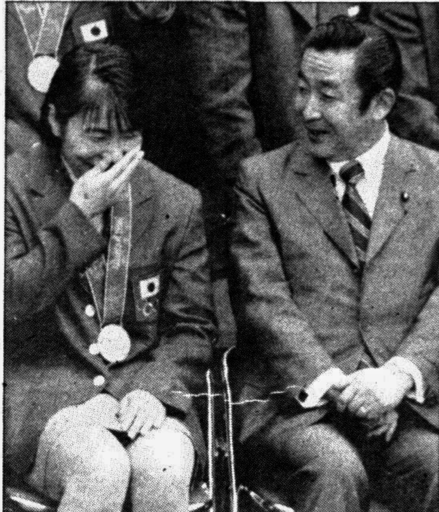
Atlanta Olympic judo gold medalist Yuko Emoto (L) chuckles as she meets Japanese Prime Minister Ryutaro Hashimoto on August 7 at the Premier's official residence in Tokyo.

ALEXANDRIA, South Africa, Aug 7 (Reuter): The dusty streets of Alexandria throb with the healthy screams of excited children playing cricket in the streets. It is a joyful noise that resounds more and more frequently throughout the black townships of South Africa as the sport continues to expand its horizons away from its traditional base among the whites of the country.