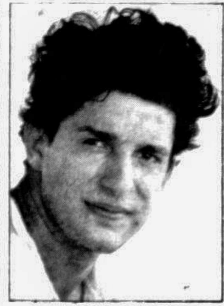
WANIM AKRAM However, a refreshed and fully recovered Waqar, with his ability to bowl late in-swinging yorkers seemingly at his will, should pose an even greater threat to England in Headingley's traditionally helpful conditions.

LEEDS, England, Aug 7: Pakistan's sultan of swinging yorkers, Waqar Younis, emerges from a nine-day rest on Thursday, ready to inflict more torment on England in the second Test at Headingley, reports Reuter.