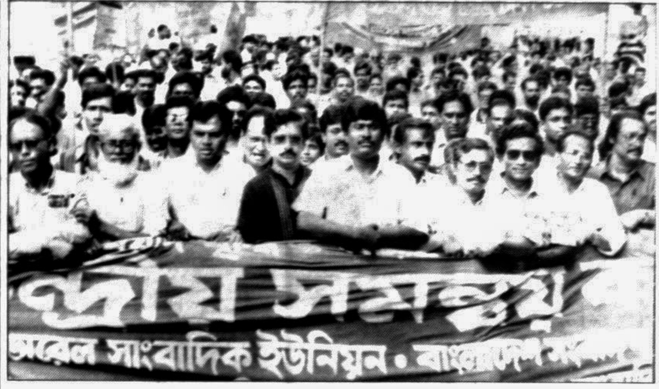
Pressmen of different newspapers led a procession towards Prime Minister's Secretariat yesterday in support of their various demands.

The Muktijudha Museum in Segunbagicha has opened a new room for nursing mothers who visit the museum. The room has been opened to facilitate mothers to breastfeed their babies.