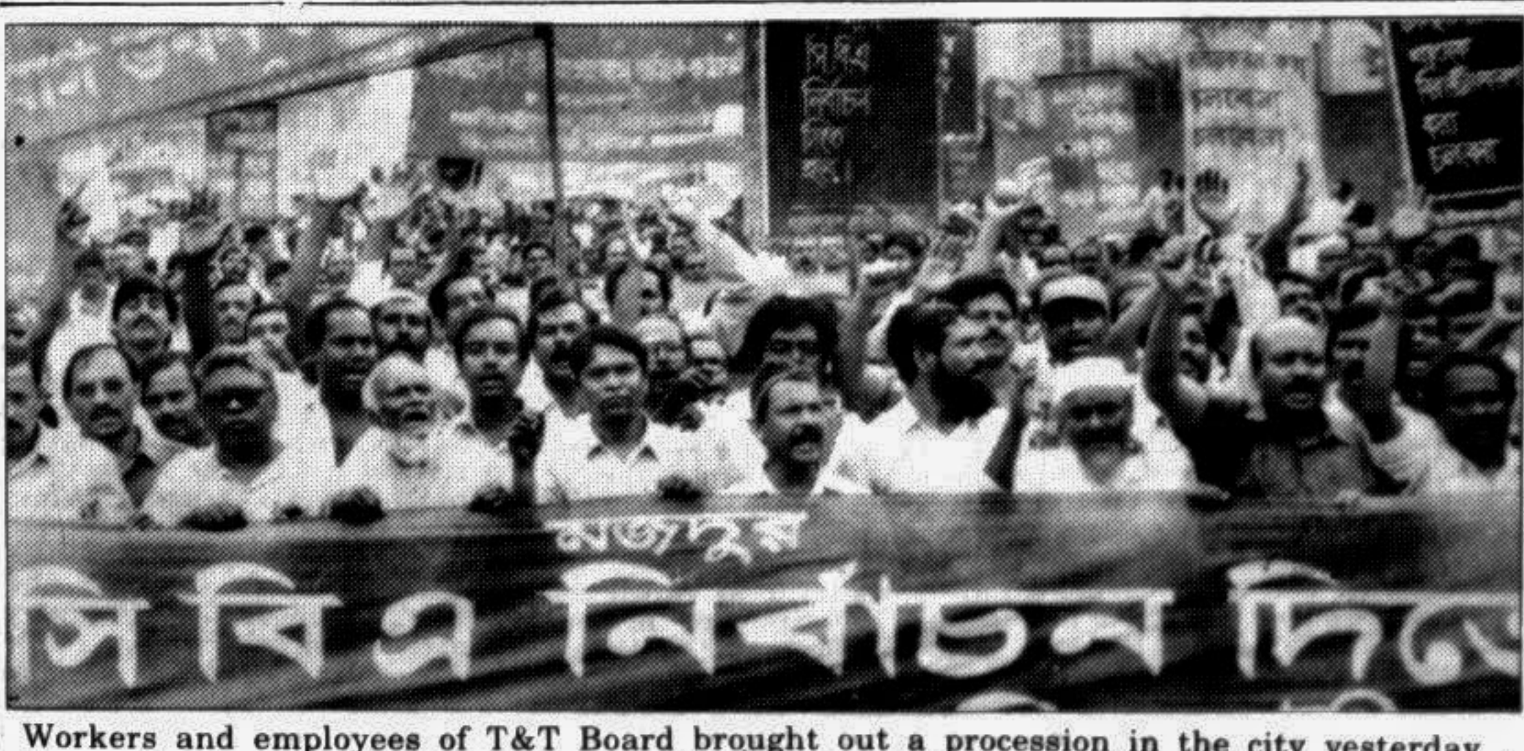
Workers and employees of T&T Board brought out a procession in the city yesterday demanding immediate announcement of CBA election schedule.

Police arrested 233 persons on various charges from different parts of the city in last 24 hours till 8 am yesterday. Of the arrested, 34 was held under warrant of arrest and 34 on charge of murder, dacoity, snatching, extortion and terrorism, said a DMP press release.