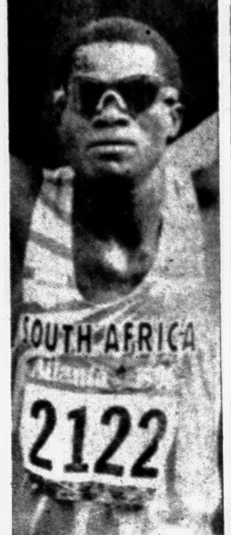
Josia Thugwane (South African distance runner) "I am dedicating this medal to him, because he made it possible, he made us free."

After winning the Olympic marathon gold.