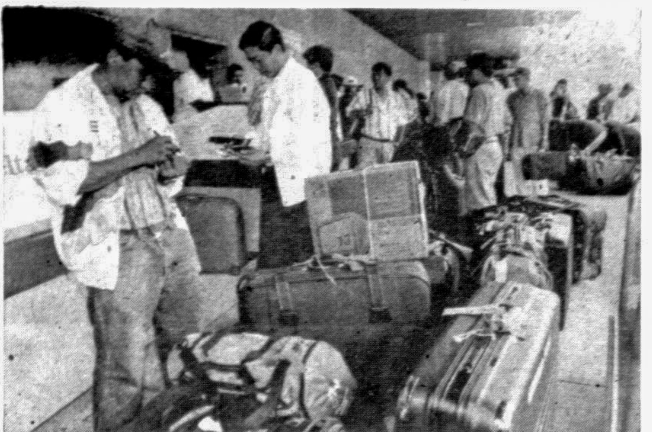
HOME BOUND: Olympians at Hartsfield International Airport in Atlanta on August 5 cue for their homeward journey

BUENOS AIRES, Argentina, Aug 6: Argentine police arrested a florist on Monday in connection with the death of a 45-year-old Brazilian who had cheered goals scored by Nigeria against Argentina in the Olympic soccer final, reports Reuters.