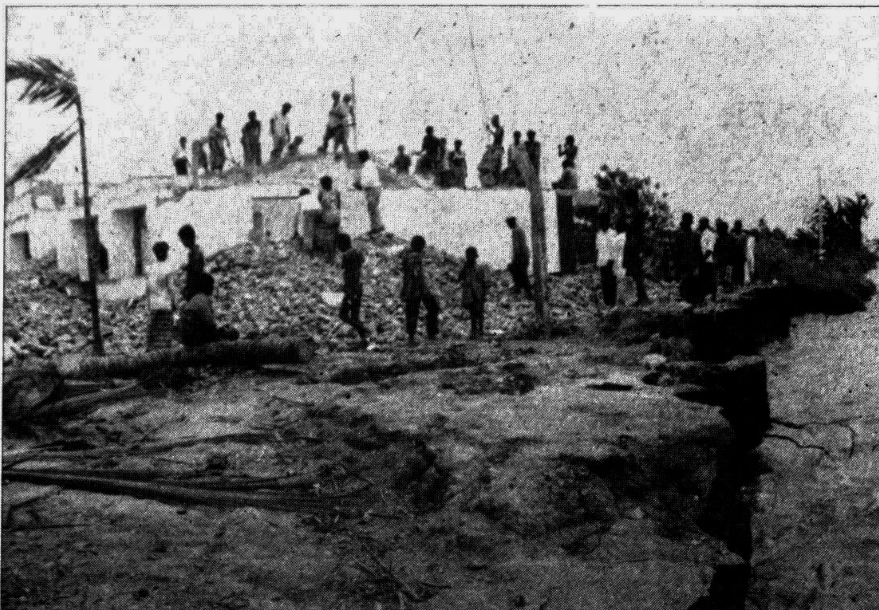
MUNSHIGANJ: Labourers working at the partially eroded building of Dhaida Health Complex in Louhaganj thana of Munshiganj.