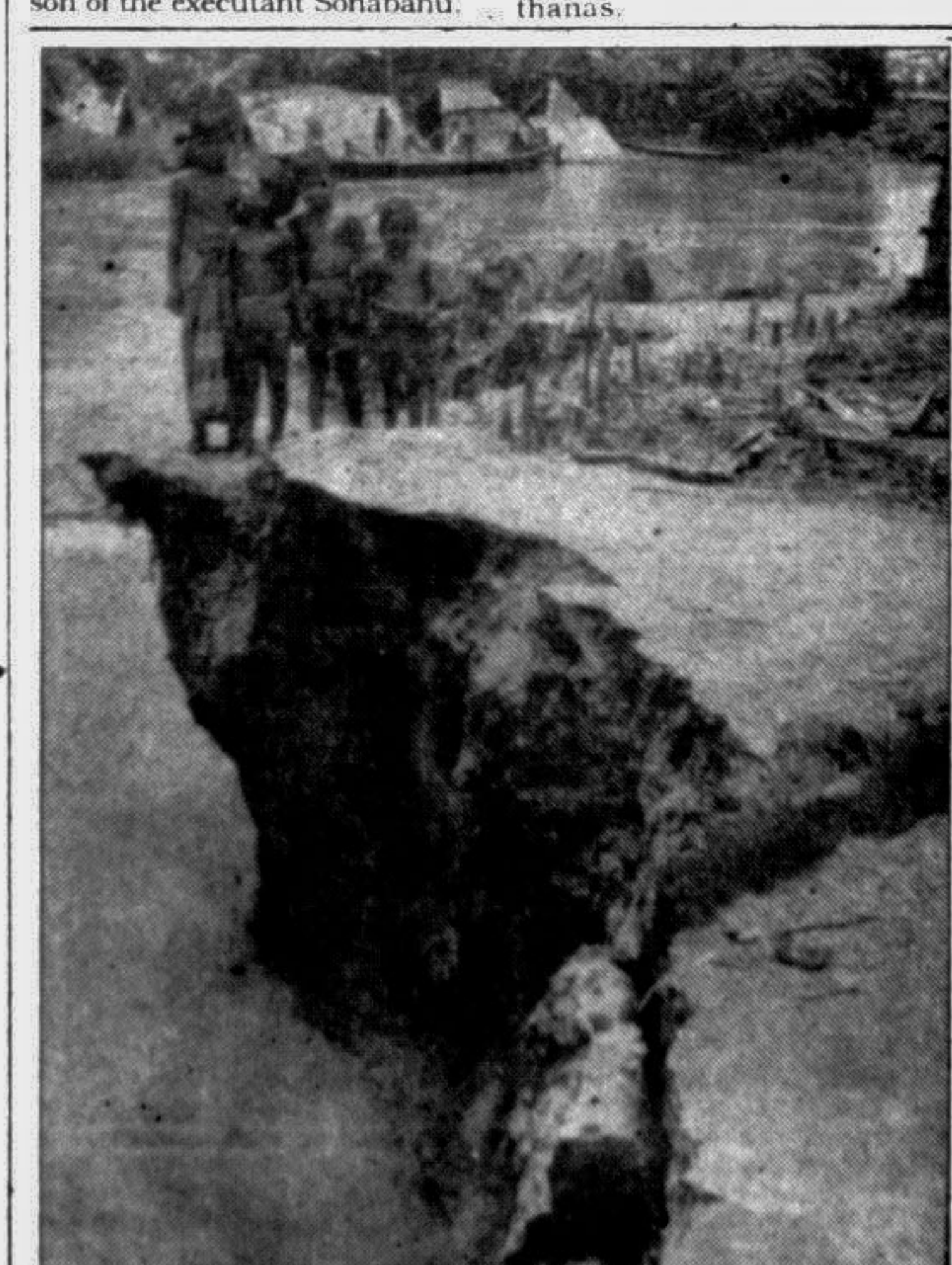
TANGAIL: Picture shows a bank in Kaku village, Tangail, under severe threat of erosion.

From Our Correspondent JHENIDAH, Aug 5: Aman paddy cultivation is likely to be hampered in the district for want of sufficient rainfall during the season, it was reported. According to District Agriculture Extension Department (AED) sources, they had taken a target to cultivate Aman on 83,510 hectares of land in Jhenidah sadar, Sailkupa, Harinakundu, Kaliyanj, Kotchandpur and Mohepsur thanas.