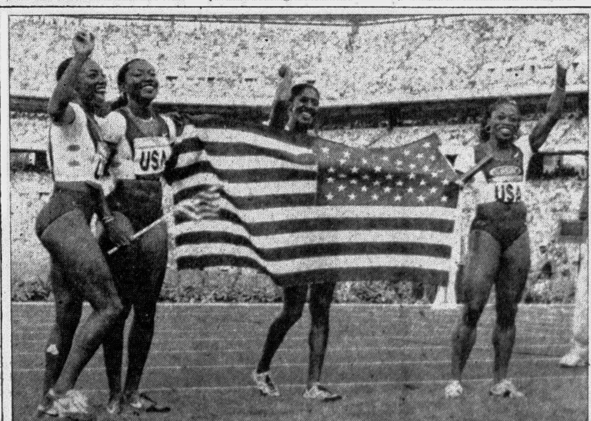
A BEAMING QUARTET: The victorious US Olympic women's 4x100m relay team proudly display their national flag after winning the event at the Olympic Stadium in Atlanta on August 3.

China, who beat Cuba in a friendly match at home this year after finishing third at the World Cup last year under new coach Lang Ping, also staged a thrilling comeback in the second set — from 5-9 to 12-11.