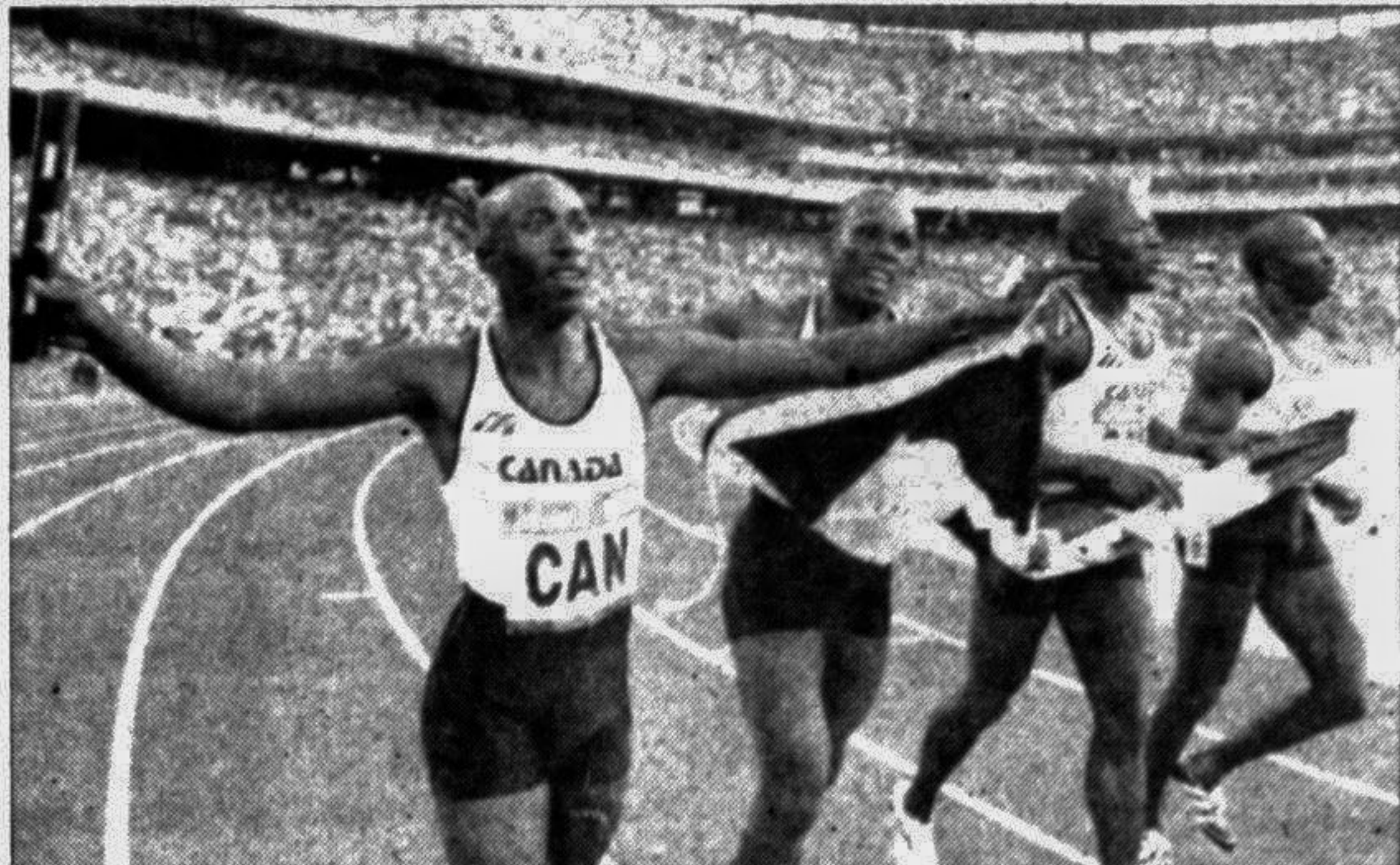
The Canadian men's 4x100m relay team doing the victory lap with their national flag after winning the gold at the Olympic Stadium in Atlanta on August 3.