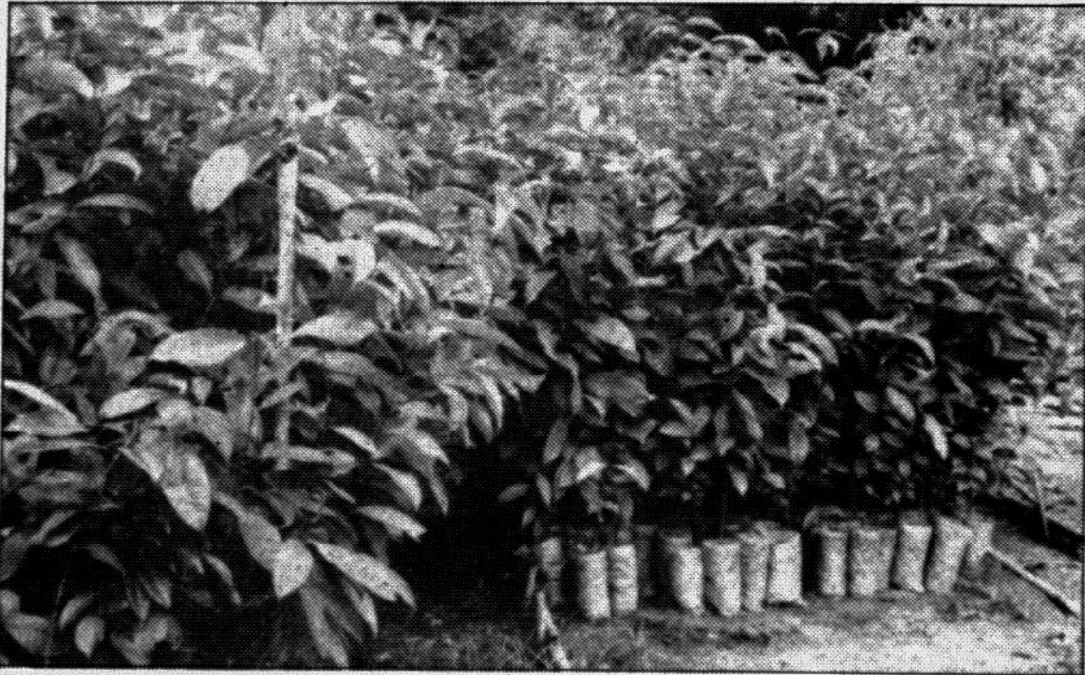
BORACHHARI: Partial view of Borachhari Forest Nursery. These seedlings are being distributed in the ongoing plantation season.

Sufferers sought the necessary step of the concerned authority to arrange early to bring the water treatment plant into commission to mitigate their sufferances.