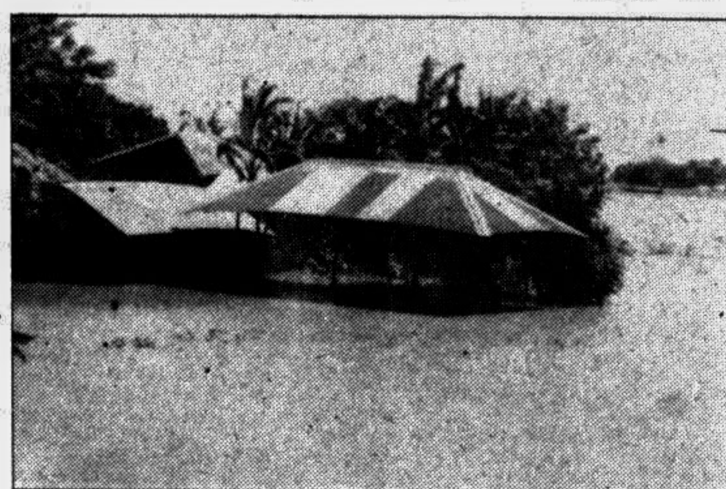
PABNA: A flood inundated house deserted by its inhabitants in village Chara in the greater district of Pabna.

meagre in quantity. According to an estimate of losses incurred in Sujanagar thana alone, prepared by the Agriculture Department, 685 hectares of paddy, 380