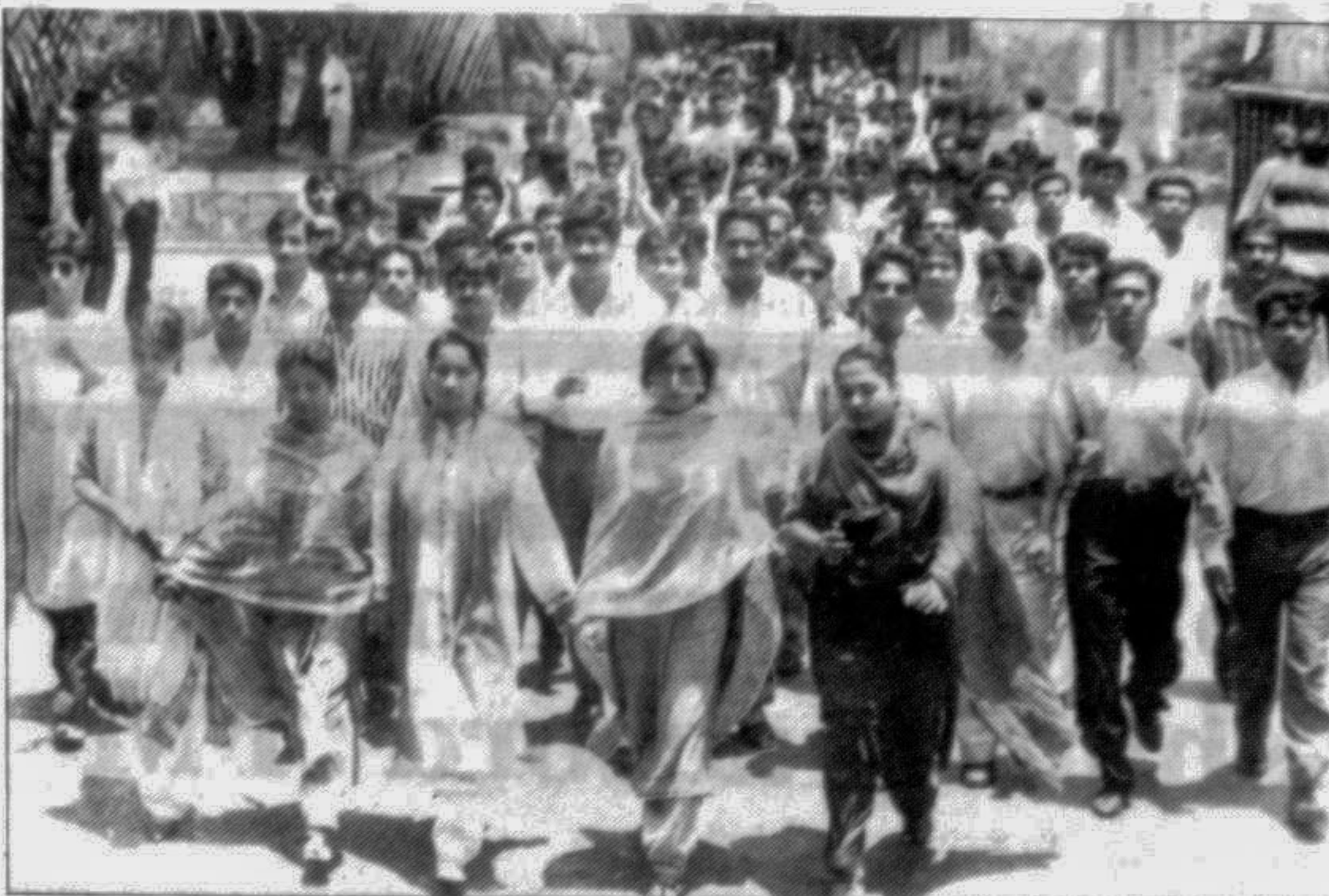
Jatiyatabadi Chhatra Dal, the student wing of BNP, brought out a procession on the Dhaka University campus yesterday.

The press release requested all members of the Coordination Committee, chiefs and deputy chiefs of all units and president and general secretary of the federations and unions to make the August 5 rally a success.