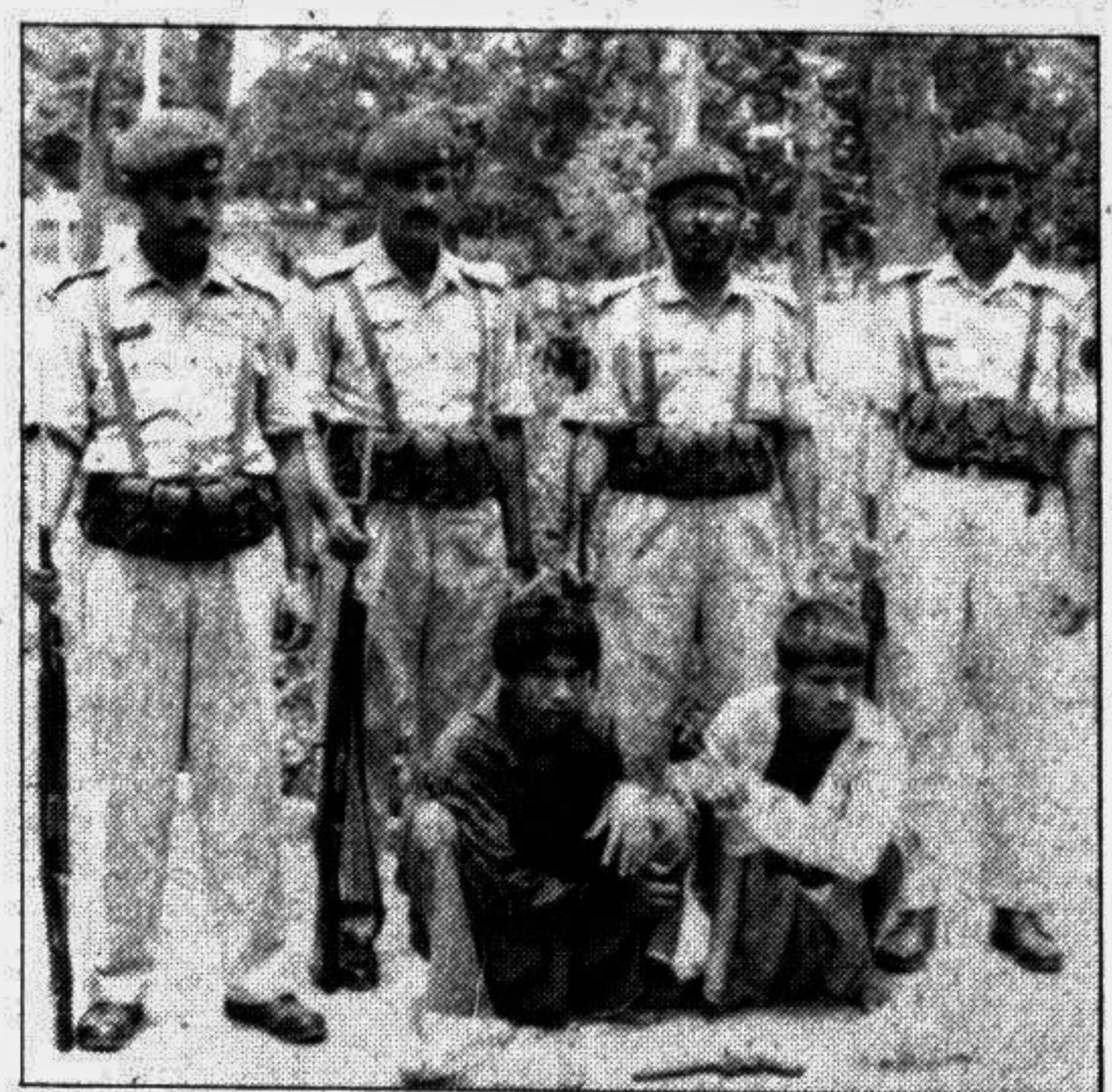
RAJSHAHI: BDR personnel recently arrested two persons with a pistol from Godagari border area. They were handed over to the Godagari thana police.

Gaibandha district Relief Department allotted total 31 bundles of C.I. sheets in favour of 31 destitute persons of Jamalpur union.