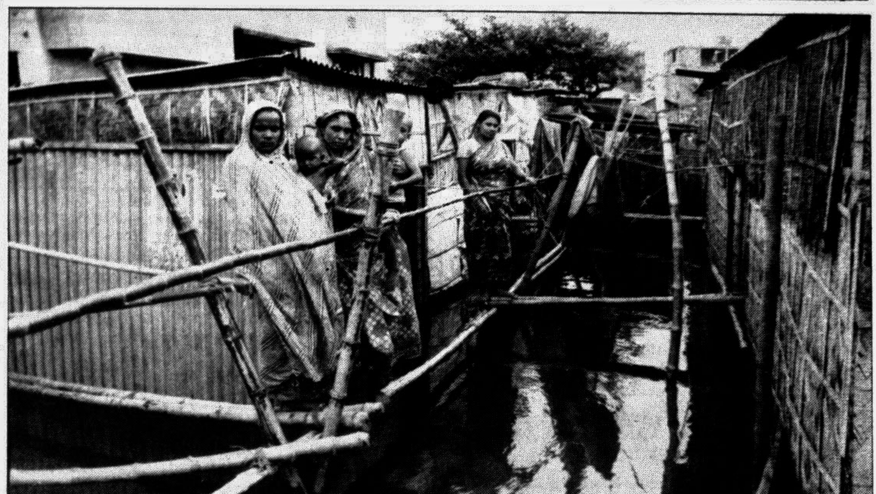
Flood situation is still unchanged in low-lying areas of the city. The photo was taken from Mugdapara area yesterday.