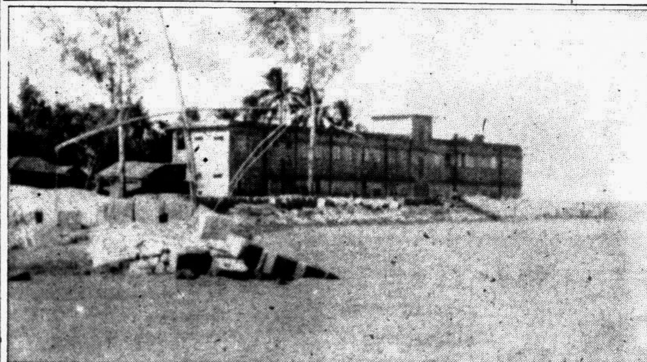
GAIBANDHA: A two-storied building of Fulchhari Thana parishad faces erosion of river Brahmaputra.

According to the police, Iesmin, 8, daughter of Akkas Ali of Manipuri ghat area in Kishoreganj town was sleeping on the night of July 9. Her parents went out of the house for attending a marriage ceremony in a neighbouring house. At about 10 pm, Masud of the same area allegedly entered the house by opening the door and pounced on Iesmin. She woke up and cried for help following which the neighbours rushed to the spot. Meanwhile Masud fled.