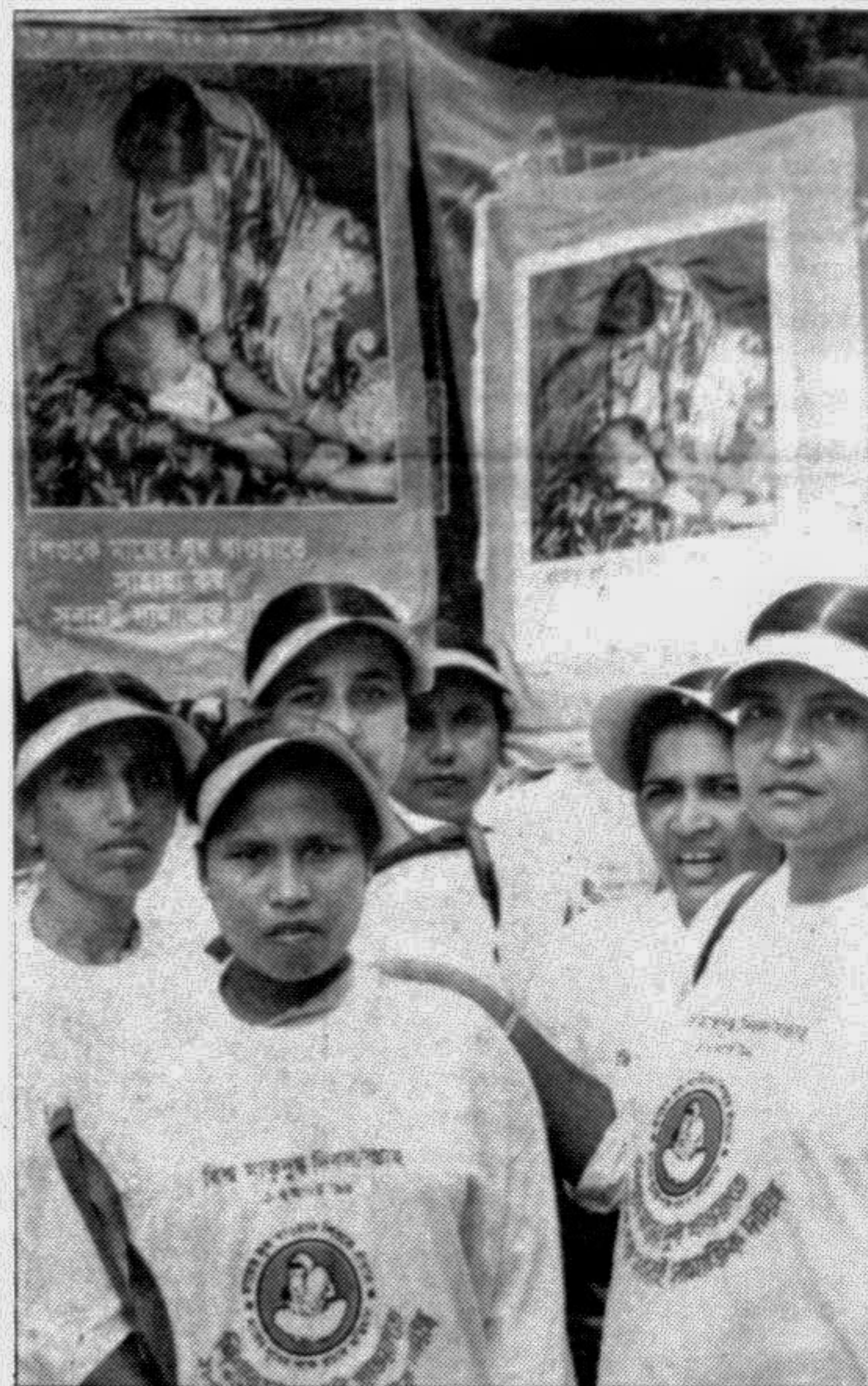
A colourful procession in the city yesterday marking the World Breastfeeding Week.