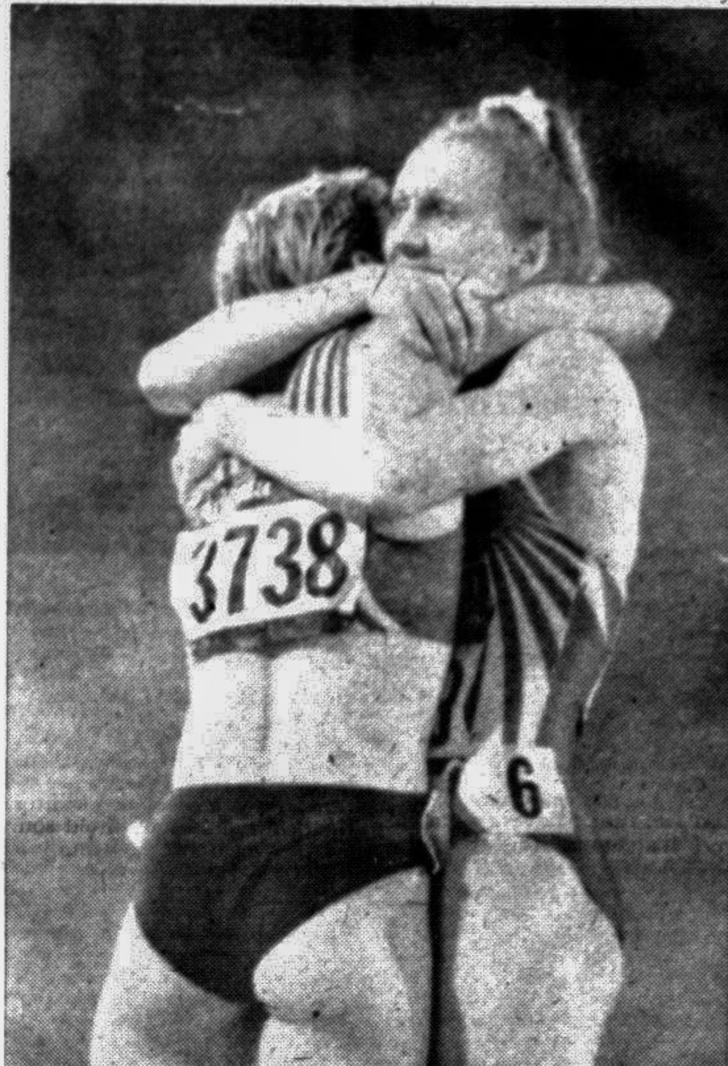
Swede Ludmila Engquist embraces Slovenia's Brigita Bukovec after winning the Olympic 100m sprint final on July 31. Bukovec finished second.

The losses left the Cubans with seven semifinalists, who are guaranteed medals, and the US team with six.