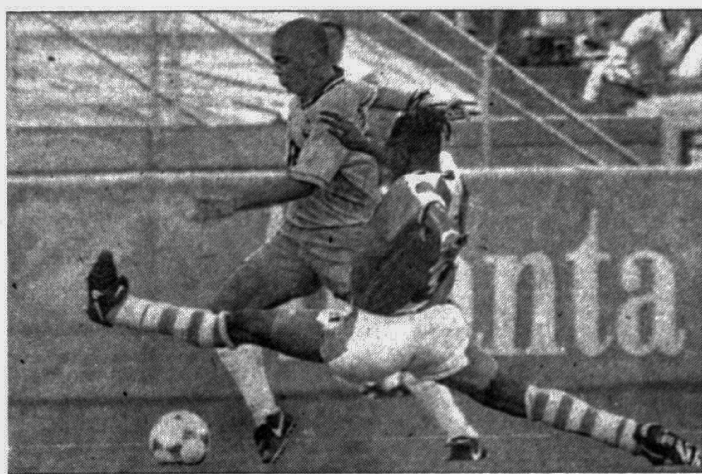
Brazilian striker Ronaldo skips a desperate challenge by Nigeria's Taribo West during their Olympic football semifinal encounter on July 31. The Africans upset the South Americans 4-3 in extra-time.

Other players gave her basketball shoes, signed balls and posed for pictures at a private meeting.