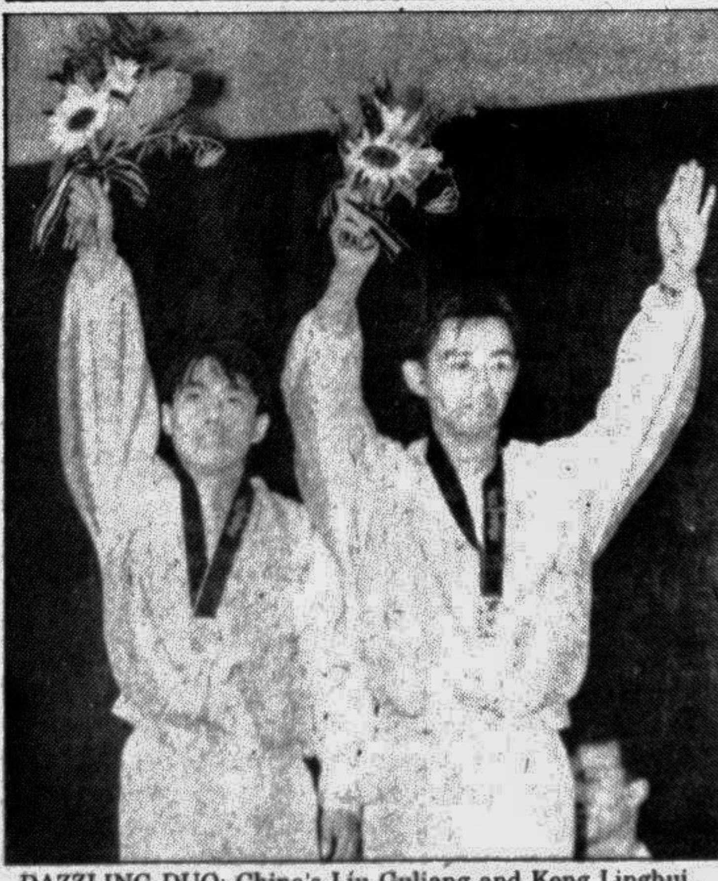
DAZZLING DUO: China's Liu Guiliang and Kong Linghui, the gold medalists in the table tennis doubles, acknowledge the crowds' applause from the podium on July 30.

A total of 170 Karatekas from 18 clubs are participating in the two-day meet, organised by Bangladesh Judo and Karate Federation.