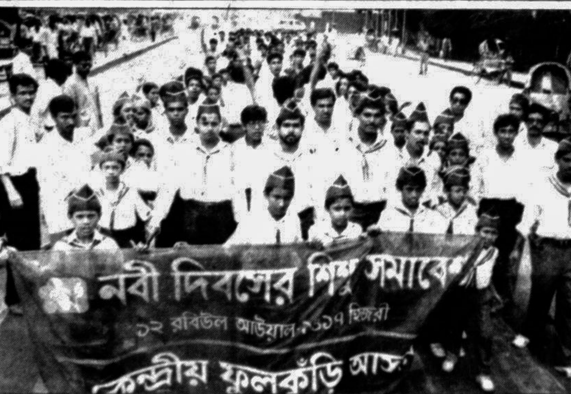
Kendriya Fulkuri Asar brought out a procession in the city on Monday marking the holy Eid-e-Miladun Nabi.

Workshop on Mathematics curriculum: Bangladesh Mathematical Society has arranged a workshop of identify the problems in teaching the newly introduced mathematics curriculum for the 9th and 10th grades of schools. Venue: Department of Mathematics, Dhaka University. Time: 9:30 pm.